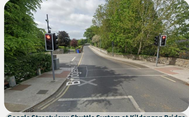
Google Streetview: Shuttle System at Kildangan Bridge,