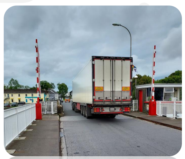
HGV Crossing Roosky Bridge