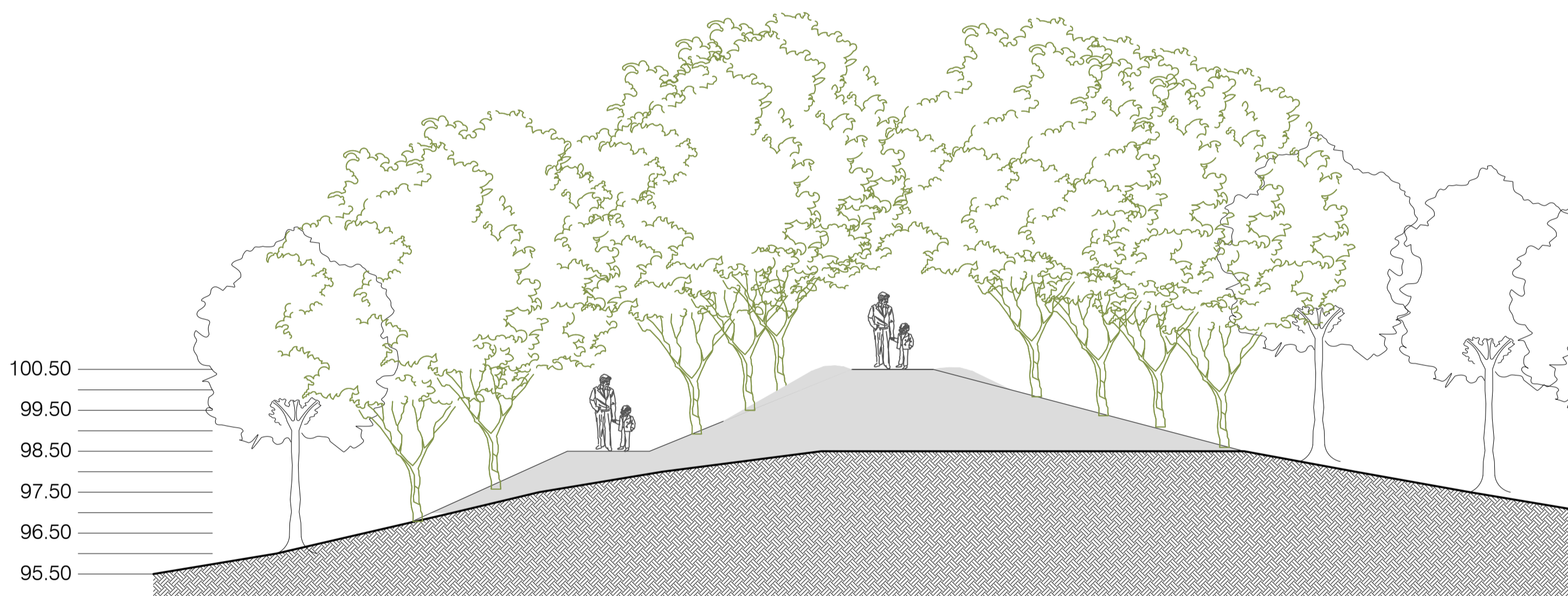
Proposed Section B - B Scale 1:100