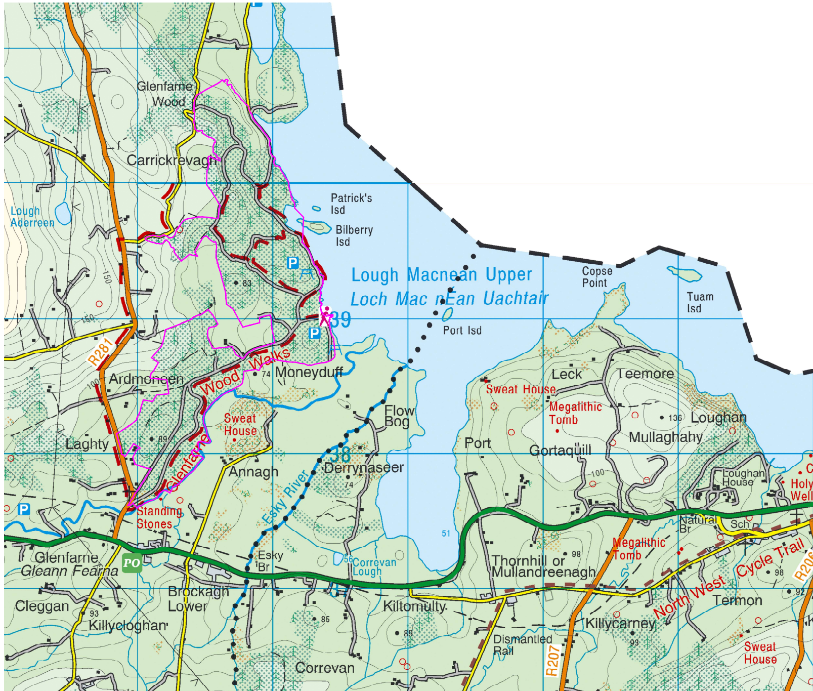
Site Location Map Scale 1:10,000