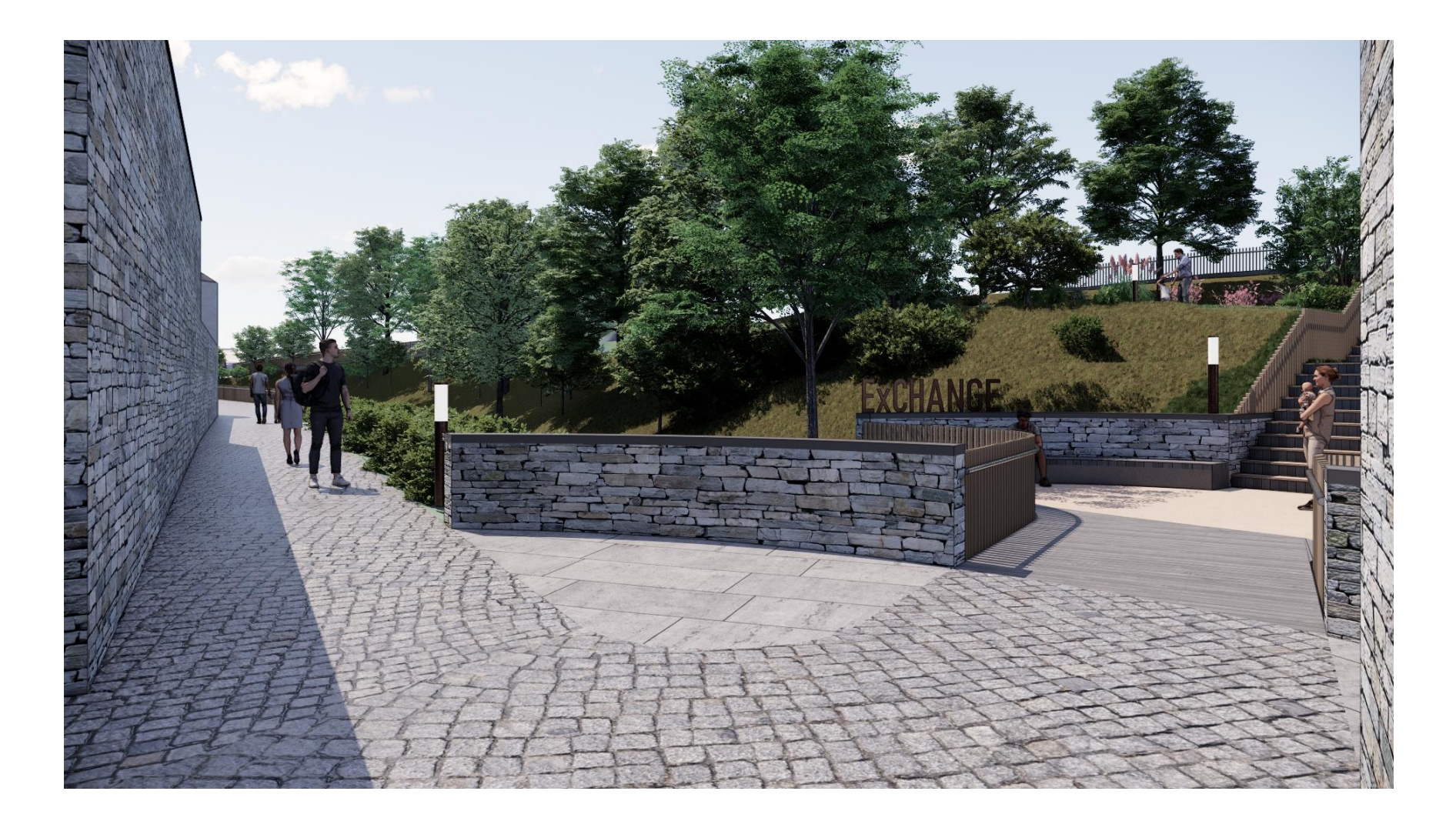
Figure 19. 3D Visual of new Pedestrian bridge with new riverside walk towards Drumshanbo Methodist Church