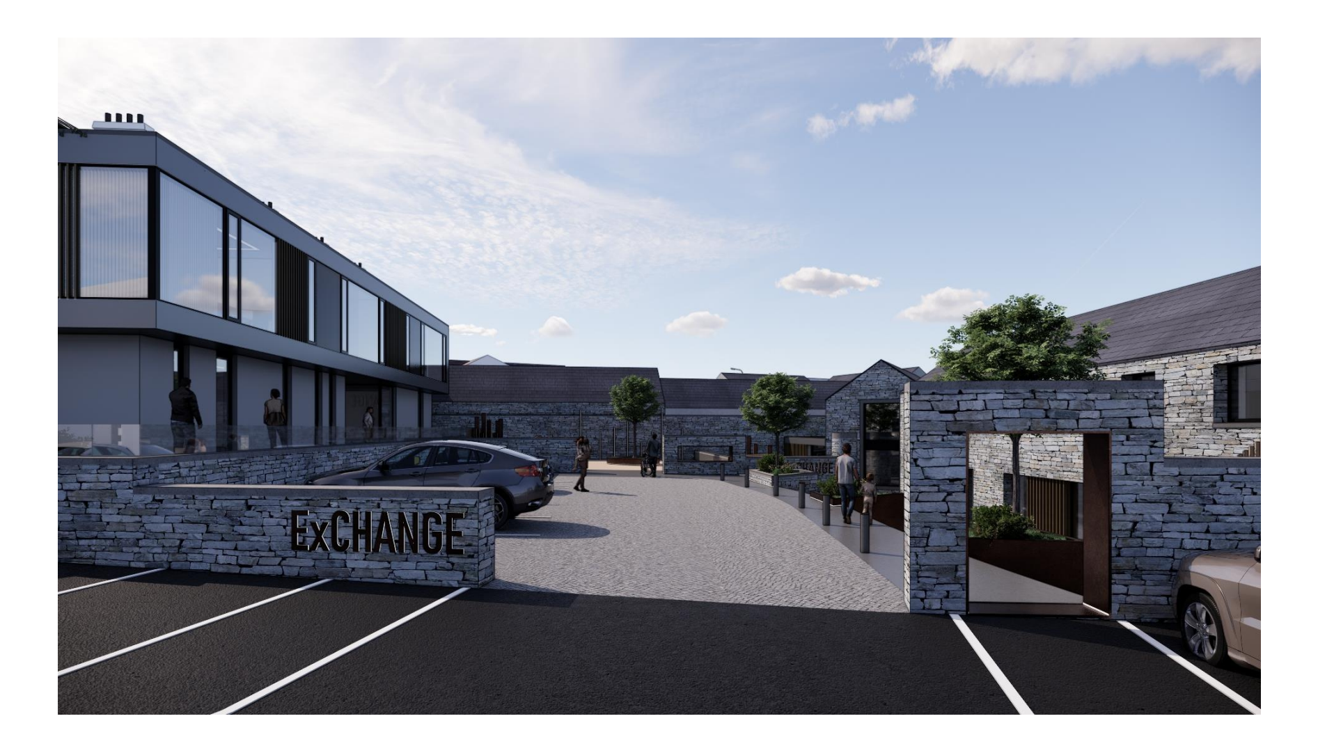
Figure 10. 3D Visual of the entrance to the new Carpark & public realm works

3D Visuals Booklet – Drumshanbo Town Centre Regeneration Scheme