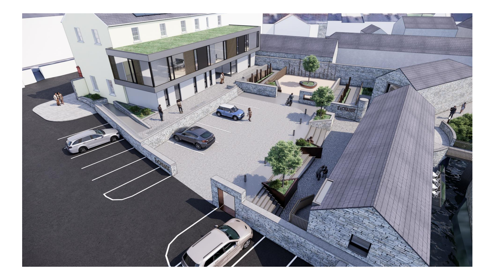
Figure 11. 3D Visual of the entrance to the new Carpark & public realm works – aerial view