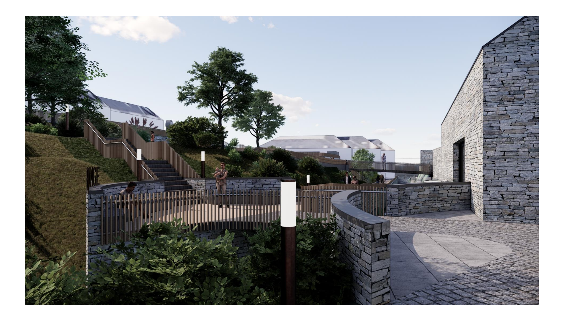
Figure 18. 3D Visual of new Pedestrian bridge with stepped access towards the 'People's Park' & The Food Hub