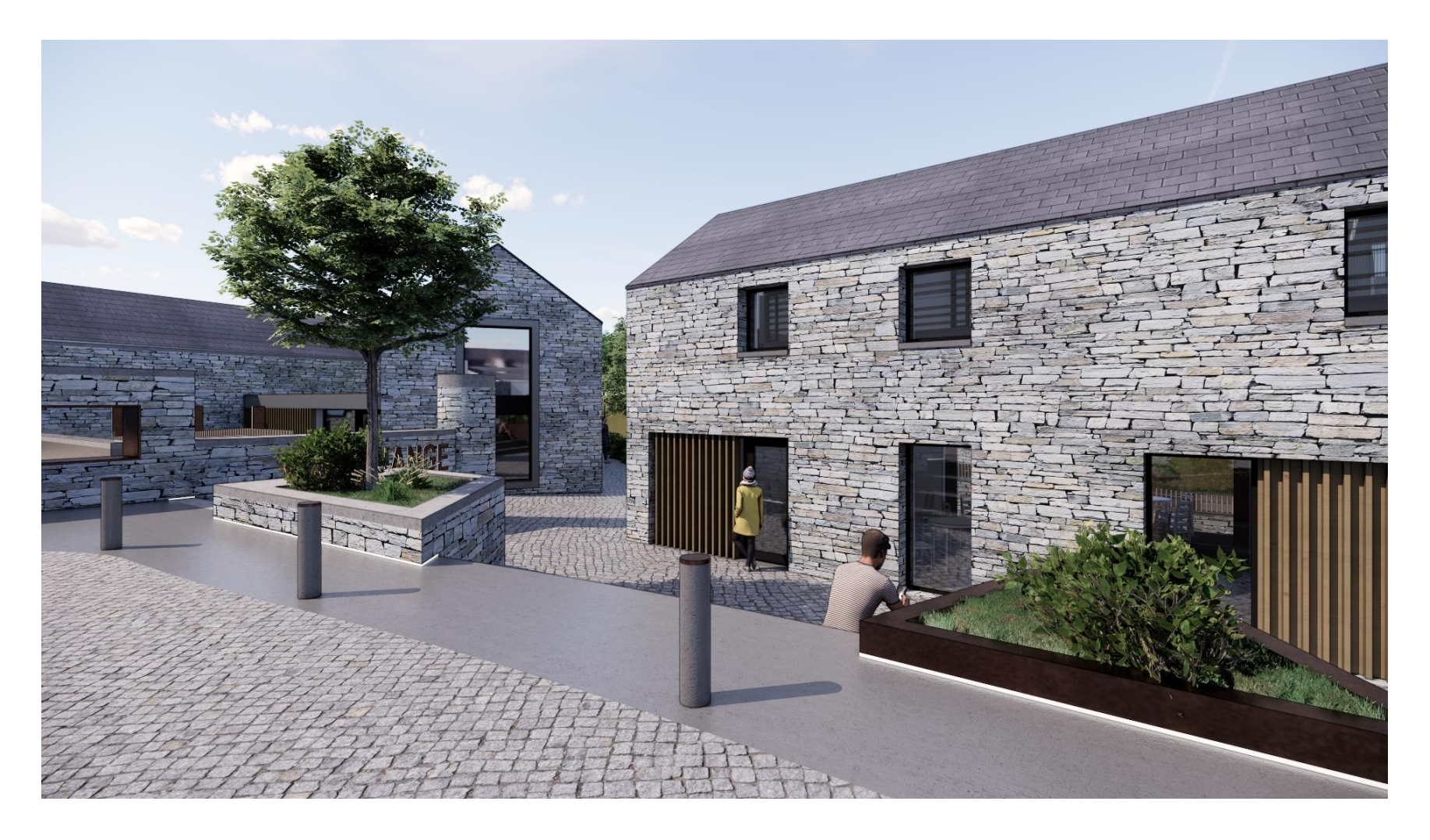
Figure 14. 3D Visual works of the 2 No. Stone outbuildings