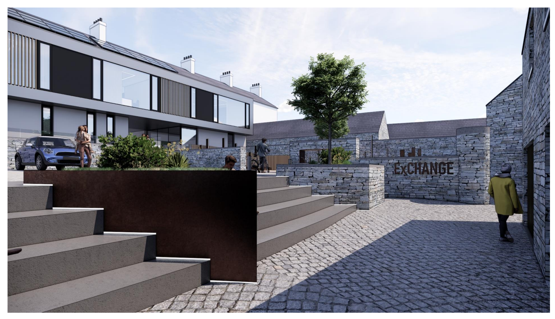
Figure 16. 3D Visual of the steps outside Building No. 3