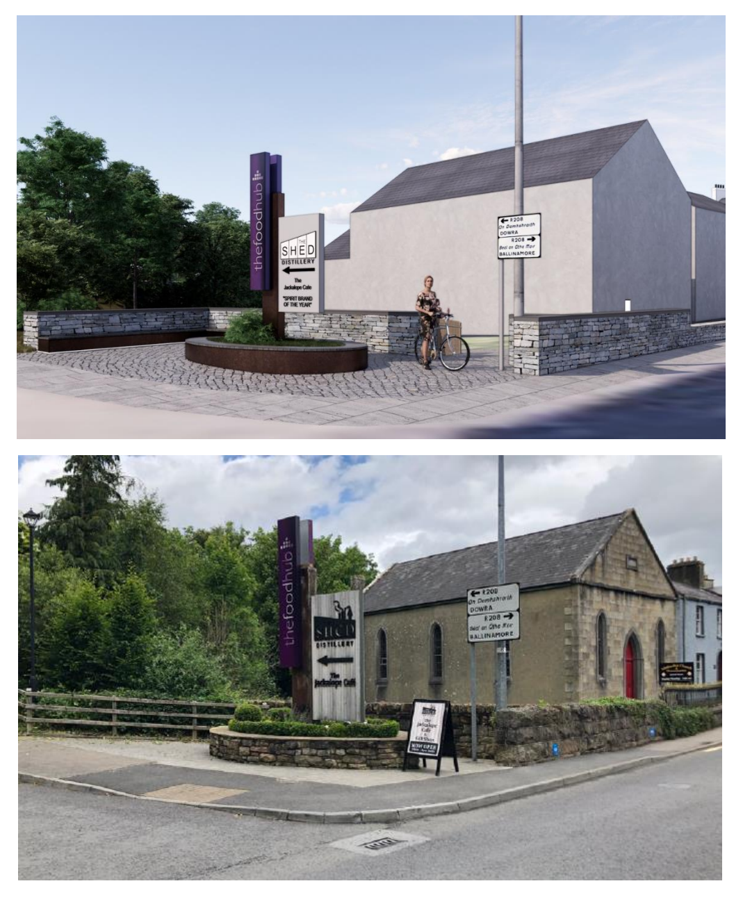
Figure 24. Existing Photo of the Carrick Road Junction

Figure 23. 3D Visual of the works at the Carrick Road Junction including creation of new pedestrian bridge