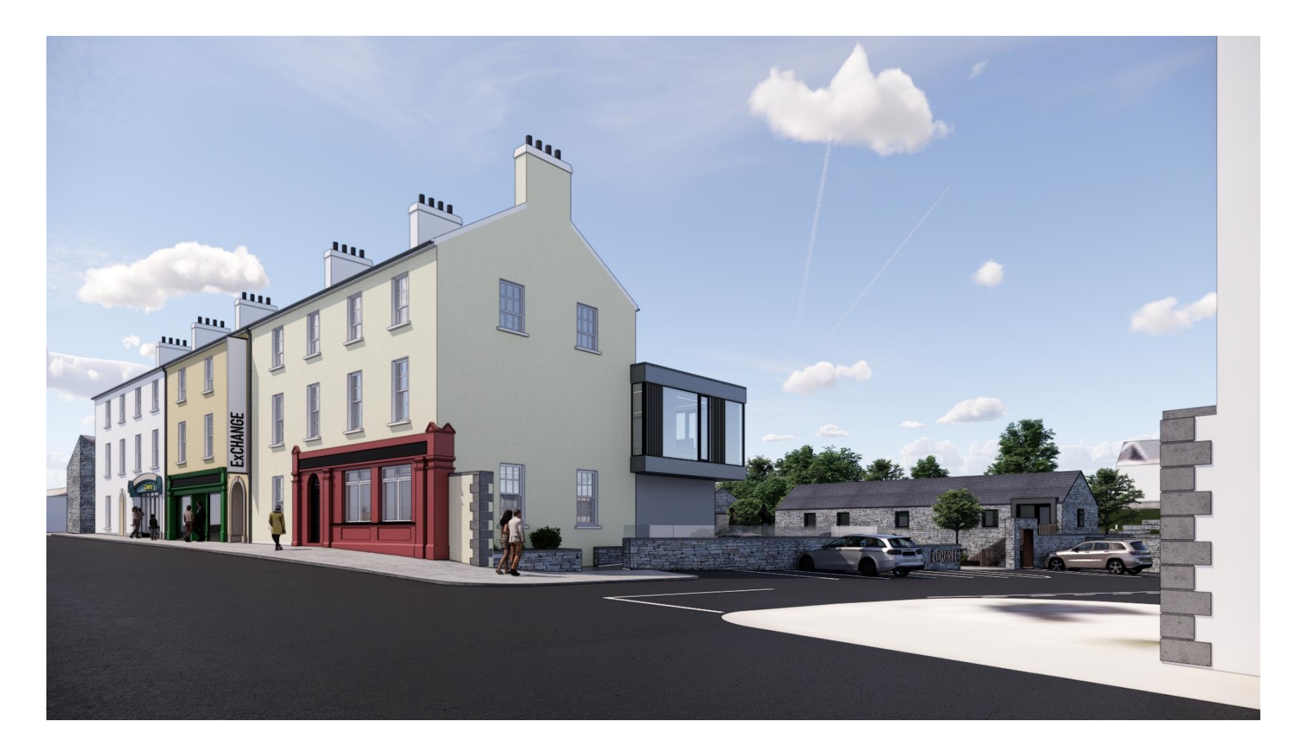
Figure 1. 3D Visual of the Regeneration Project from the Main Street