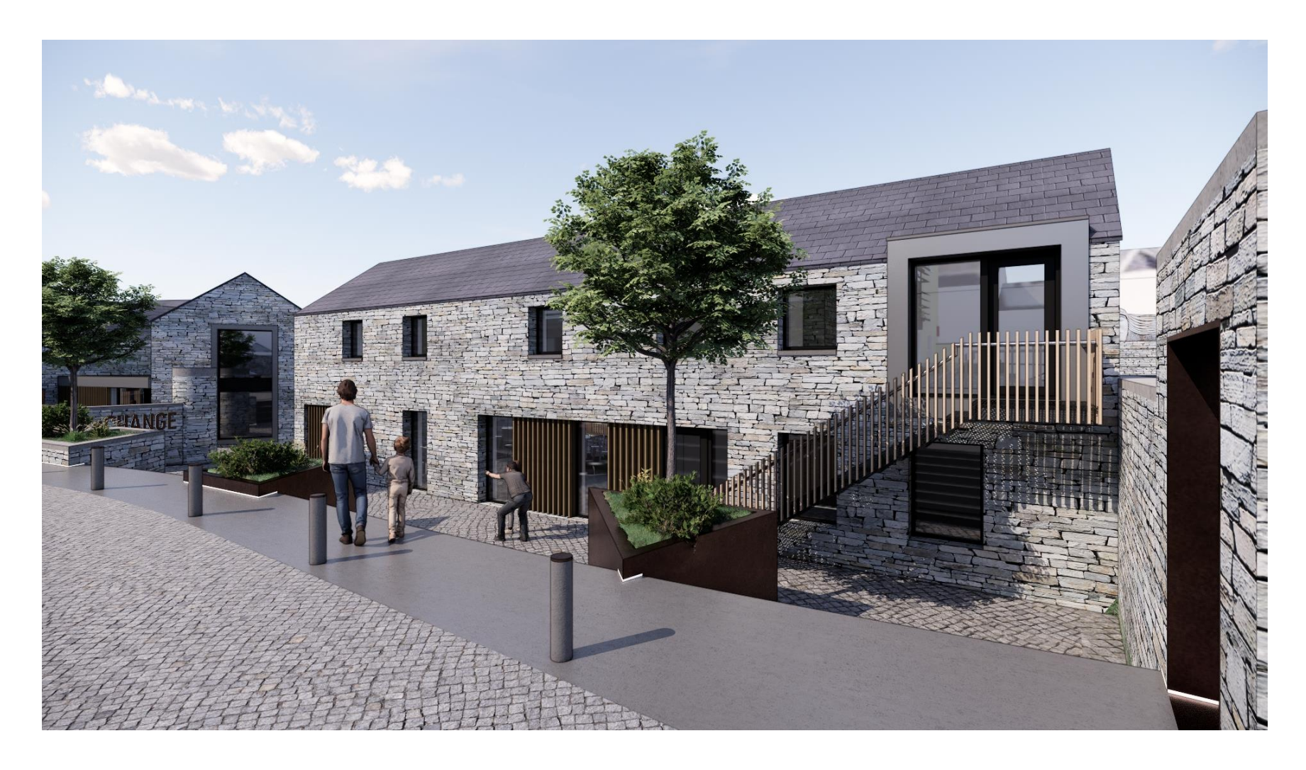
Figure 13. 3D Visual of works to Building No.3 (Former Forge)