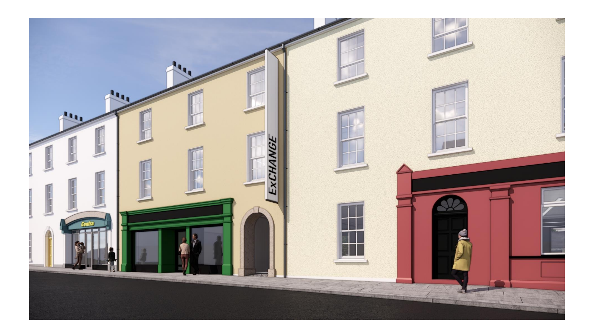
Figure 4. 3D Visual of the Re-development Works to Former Bank of Ireland & Earley's Buildings

3D Visuals Booklet – Drumshanbo Town Centre Regeneration Scheme