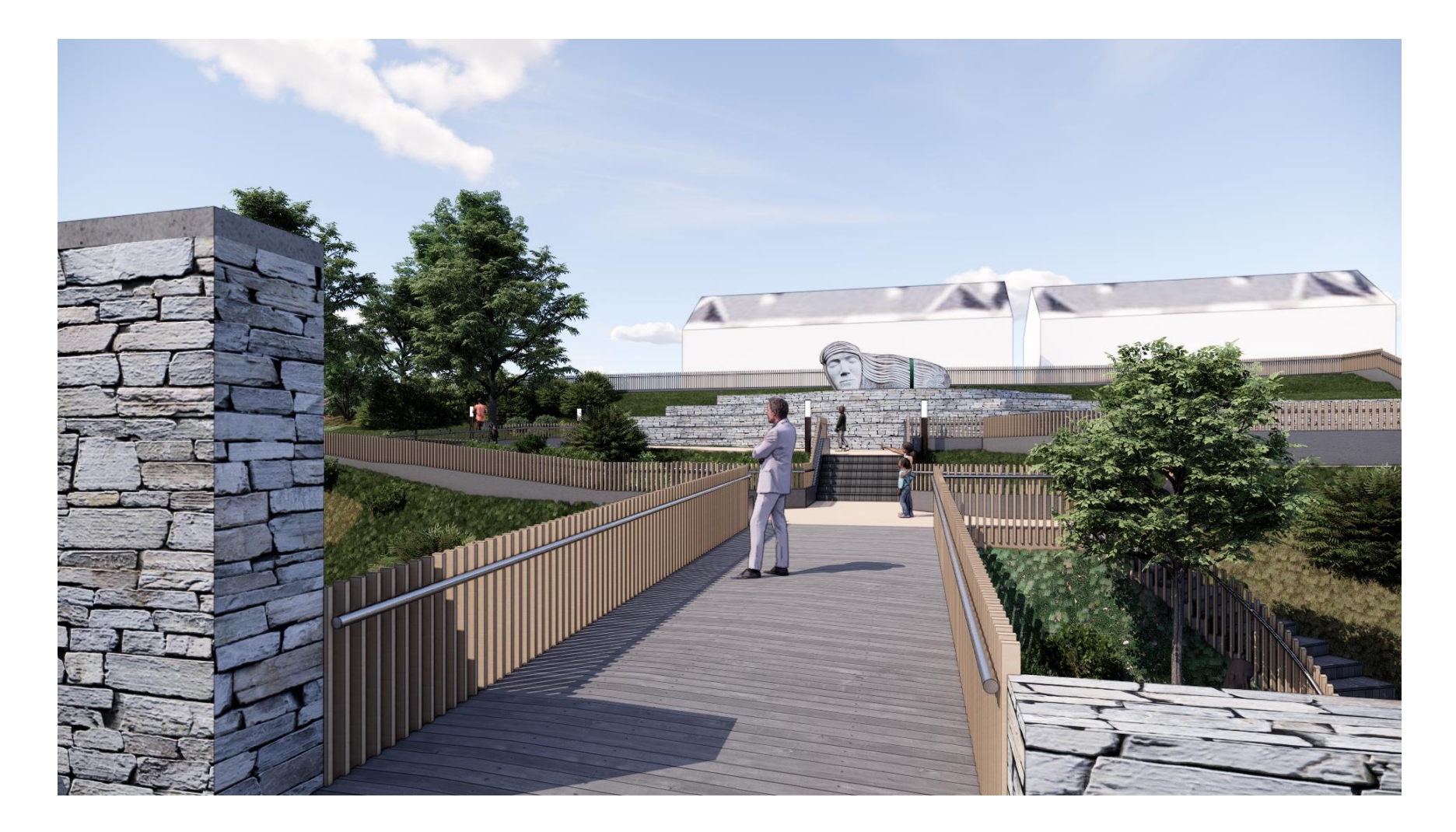
Figure 27. 3D Visual of the works towards the People's Park from the existing footbridge – with the Danú Statue proposed in new location