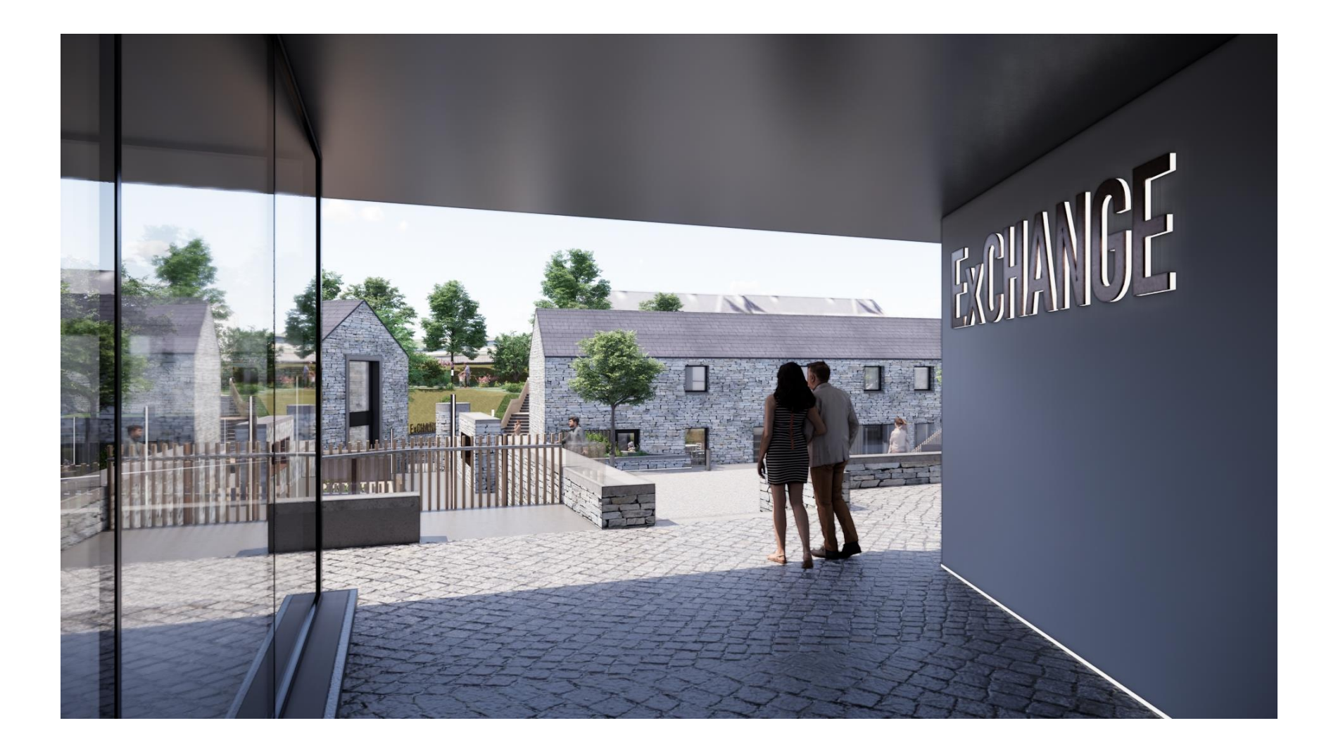
Figure 7. 3D Visual through the new pedestrian link through to the public realm and carpark