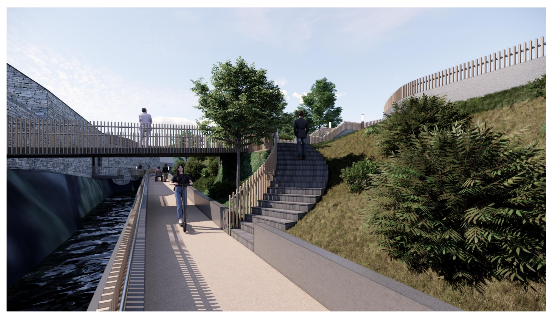
Figure 28. 3D Visual indicating new stepped access towards 'People's Park' and works to existing riverside walk.