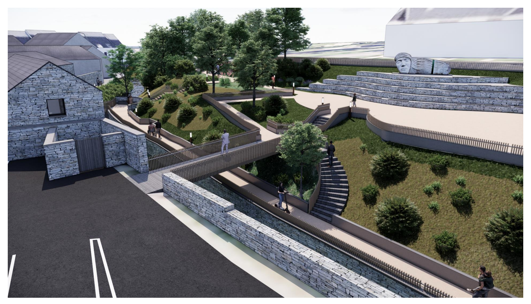
Figure 26. 3D Visual of the works towards the People's Park