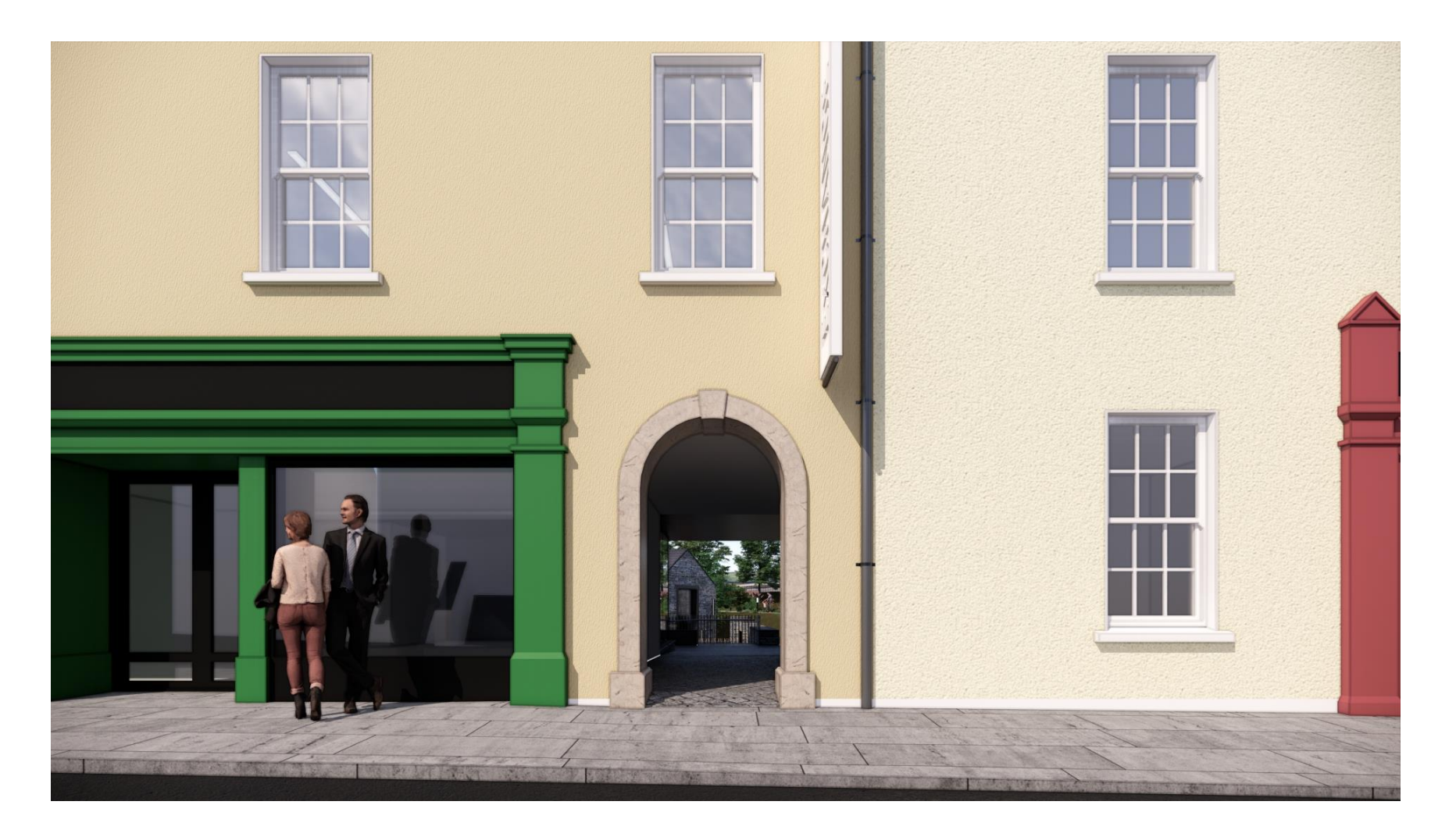
Figure 5. 3D Visual of the new pedestrian link to the Smart Working Facility entrance and through to the public realm and associated works.