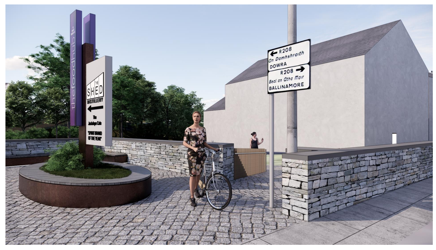
Figure 22. 3D Visual of the works at the Carrick Road Junction including creation of new pedestrian bridge