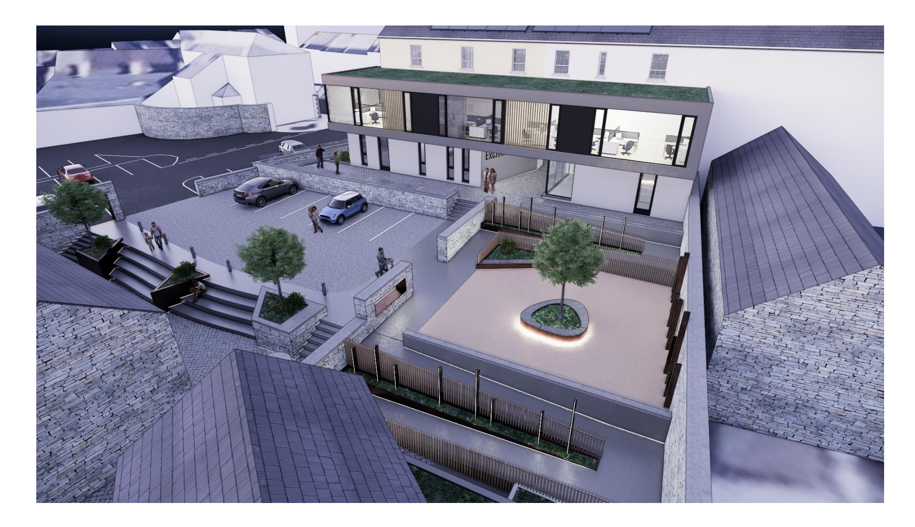
Figure 9. 3D Visual of the Regeneration Works – aerial view