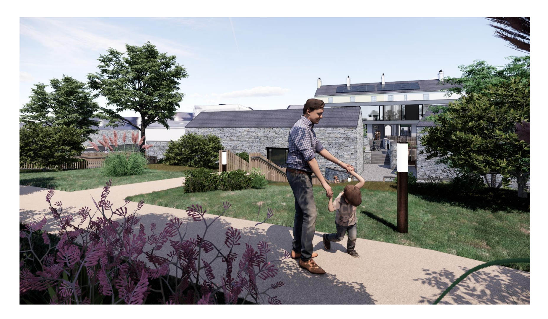
Figure 25. 3D Visual of works at People's Park