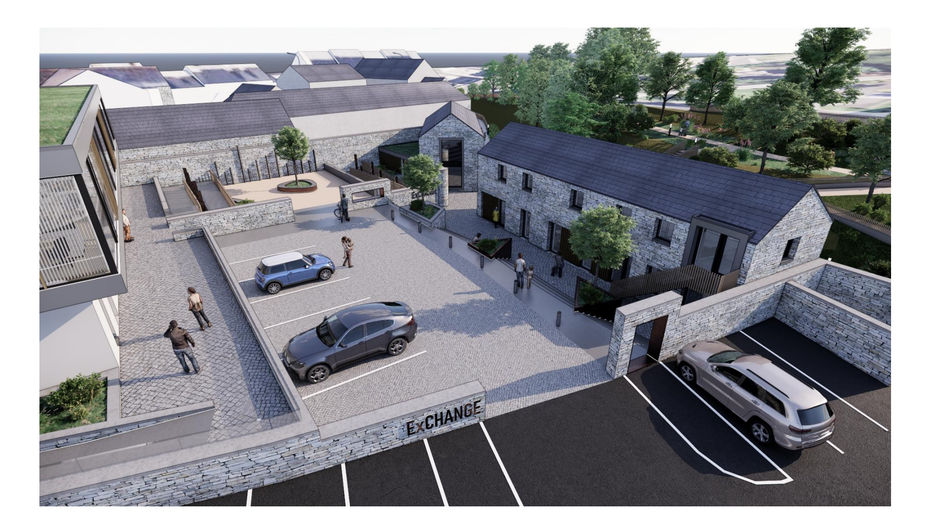
Figure 12. 3D Visual of the entrance to the new Carpark & public realm works – aerial view