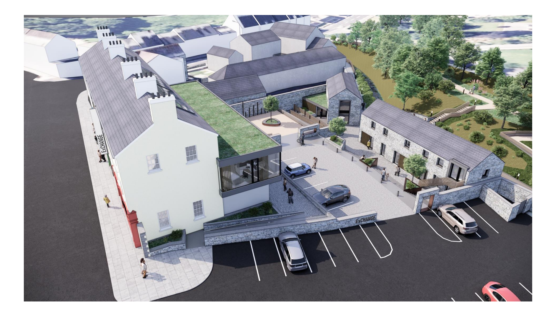
Figure 3. 3D Visual of the Regeneration Project – Aerial View from existing Carpark

3D Visuals Booklet – Drumshanbo Town Centre Regeneration Scheme