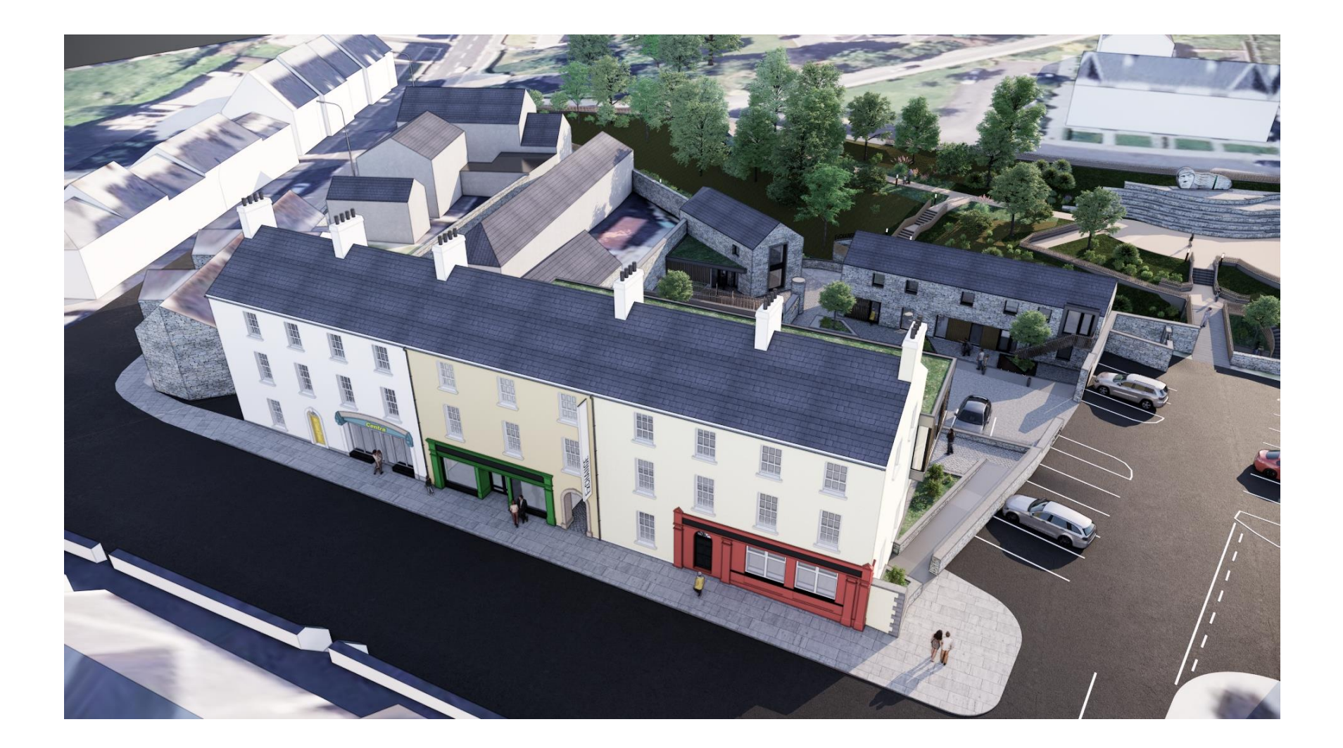
Figure 2. 3D Visual of the Regeneration Project - Aerial View