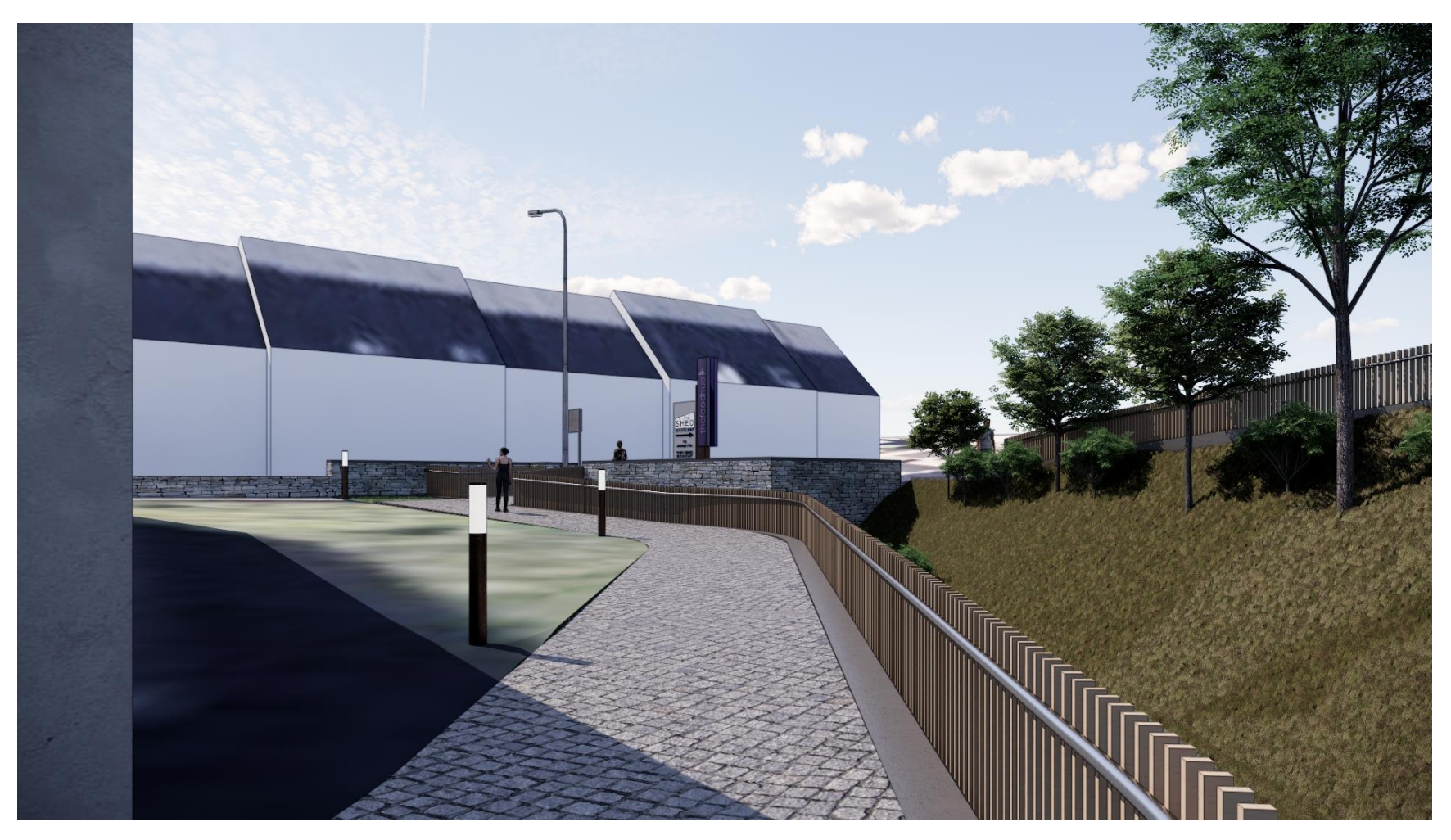
Figure 21. 3D Visual of new Pedestrian walkway within the curtilage of Drumshanbo Methodist Church