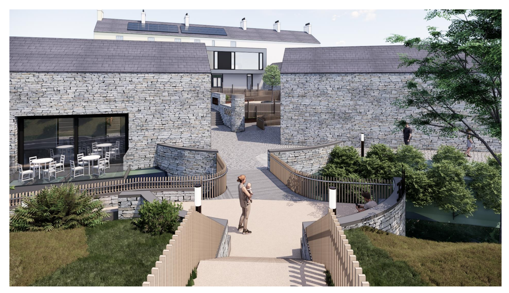
Figure 17. 3D Visual of new Pedestrian bridge with stepped access towards the 'People's Park' & The Food Hub