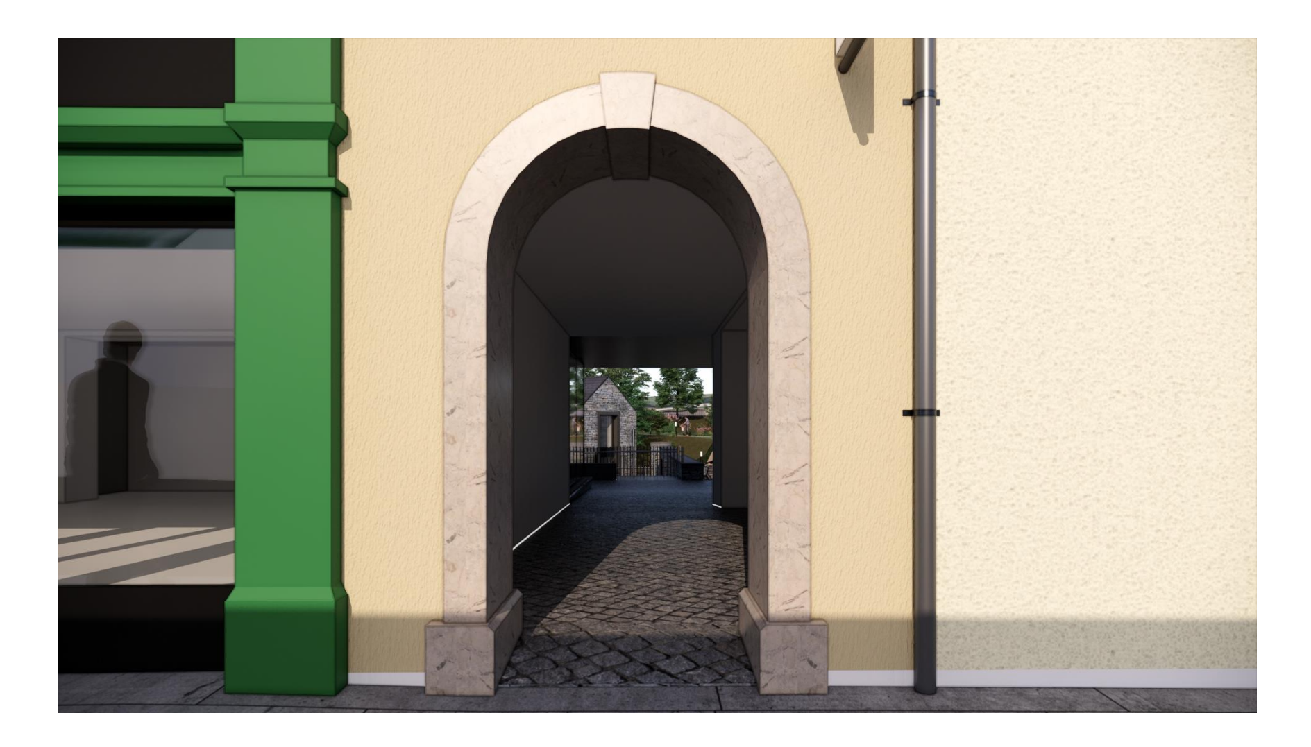
Figure 6. 3D Visual of the new pedestrian link to the Smart Working Facility entrance and through to the public realm and associated works