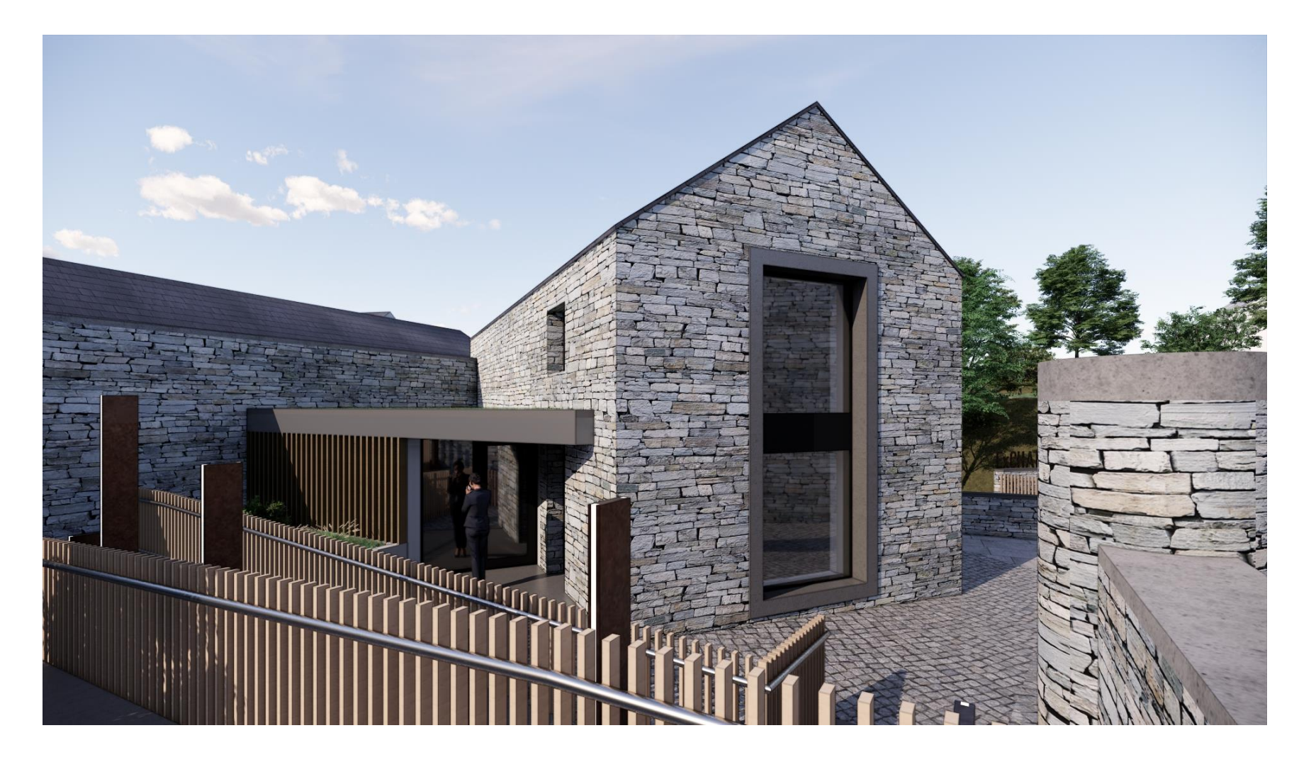
Figure 15. 3D Visual works to Building No.4