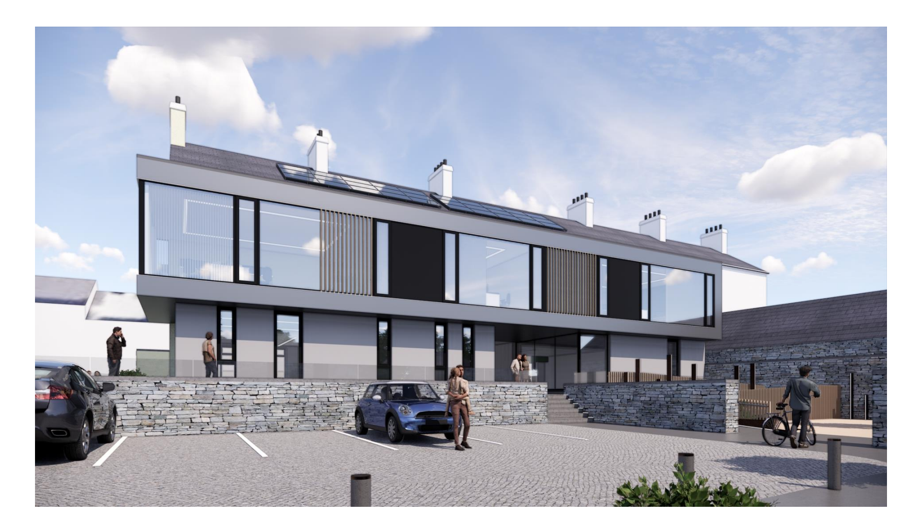
Figure 8. 3D Visual of the new extension of the Former Bank of Ireland & Early's Buildings from the new carpark