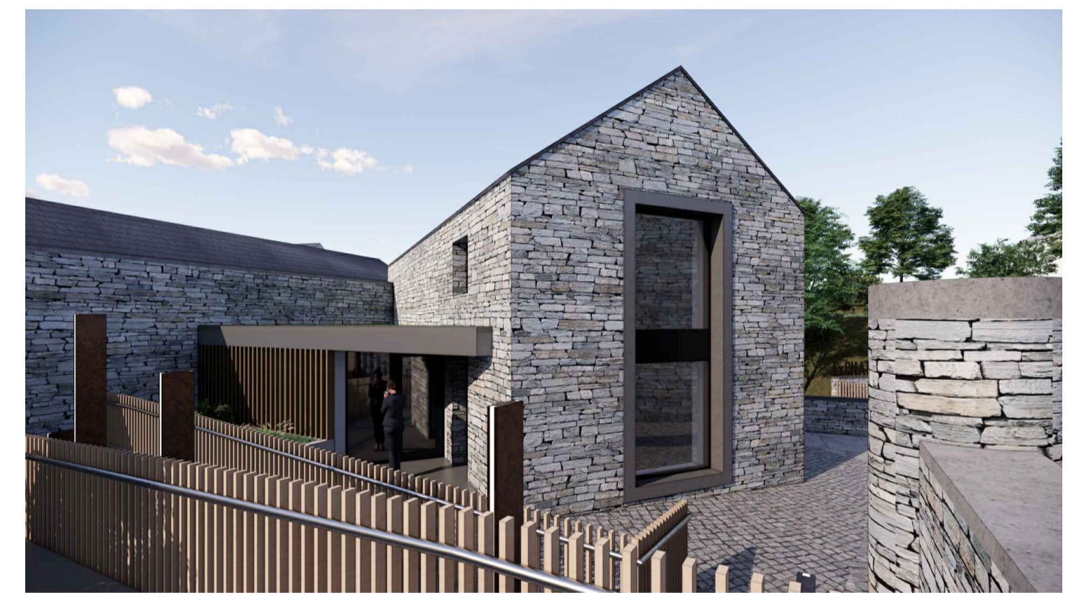
3D Visual of Proposed Redevelopment Works to Building No. 4