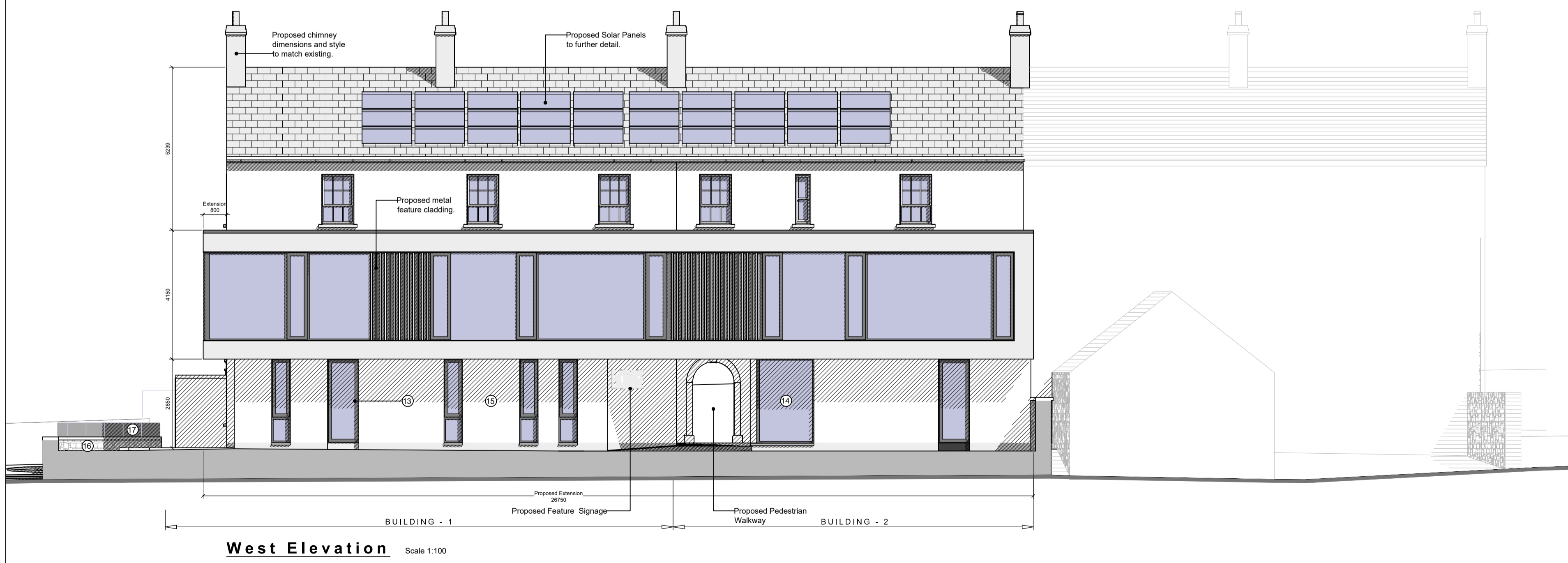
West Elevation Scale 1:100