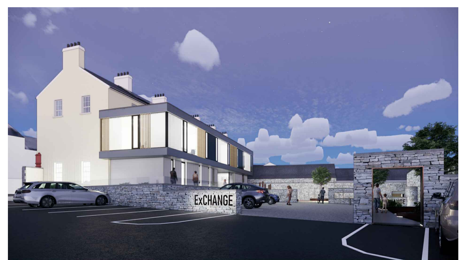
3D Visual from, Market Street Car-park, of Proposed Redevelopment Works to Building's No. 1 & 2