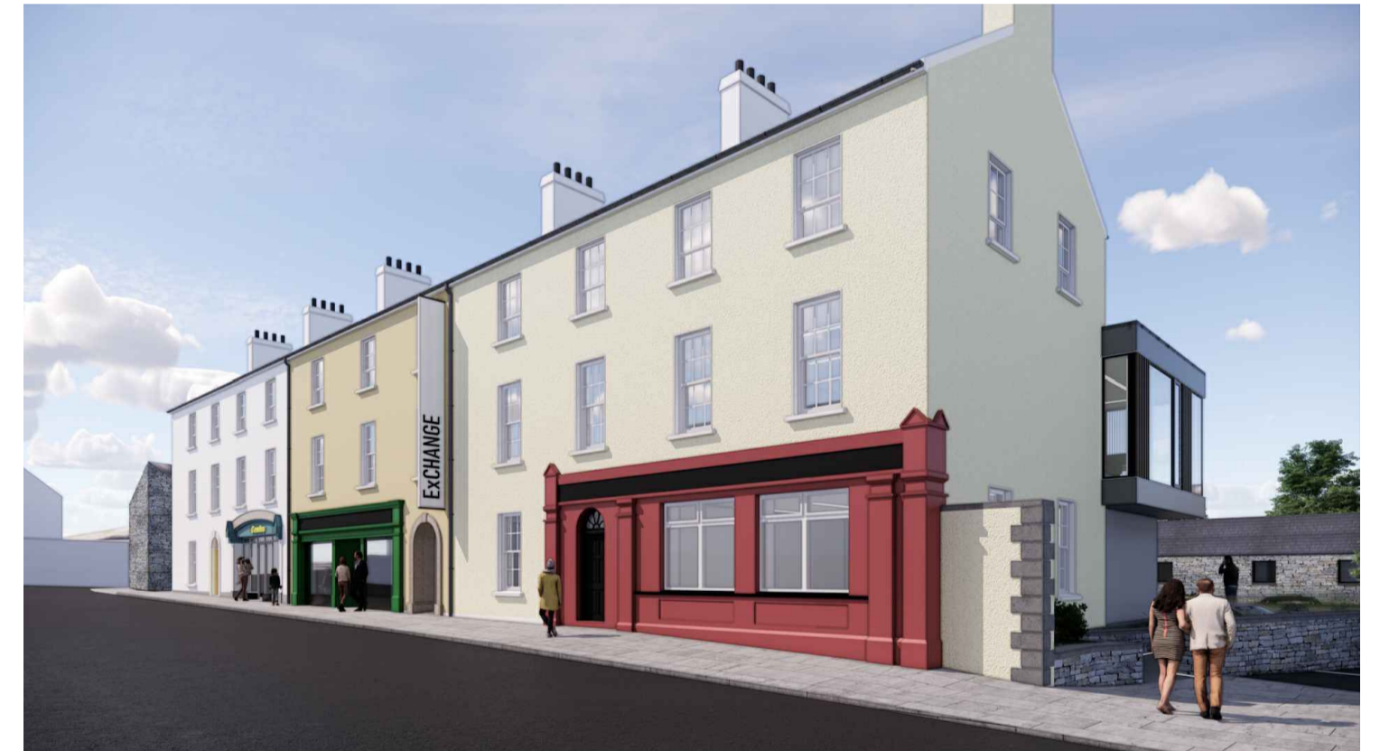
3D Visual from, Main Street, of Proposed Redevelopment Works to Building's No. 1 & 2