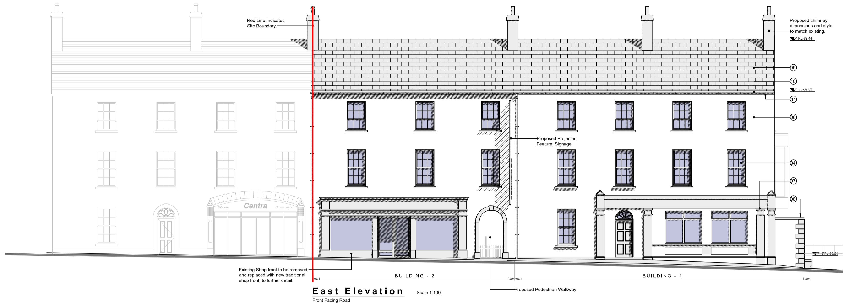
East Elevation Scale 1:100 Front Facing Road