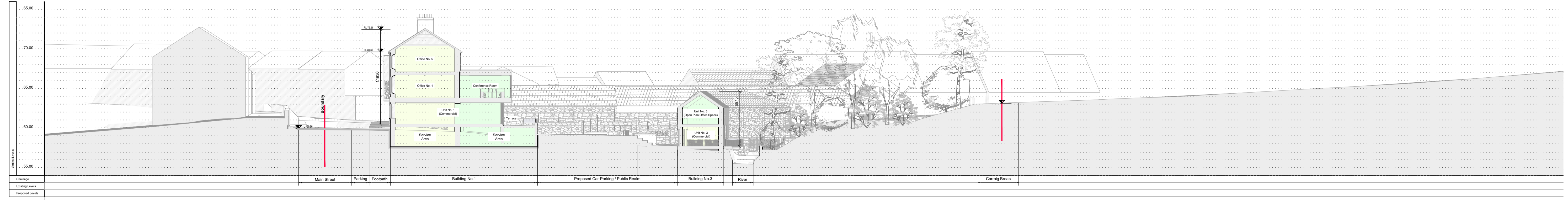
PROPOSED SITE SECTION A-A Scale 1:500