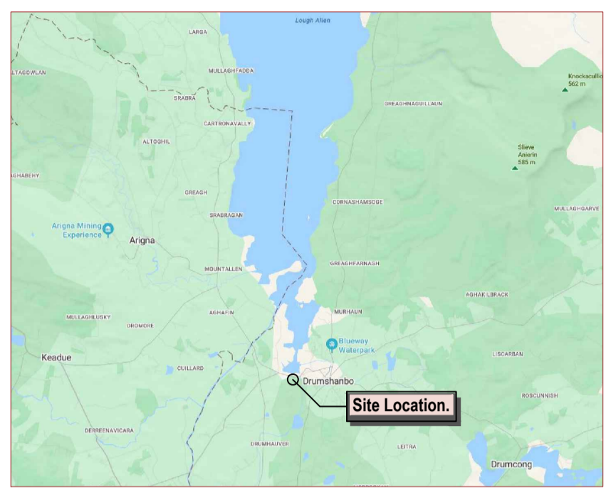
Location Map - NTS