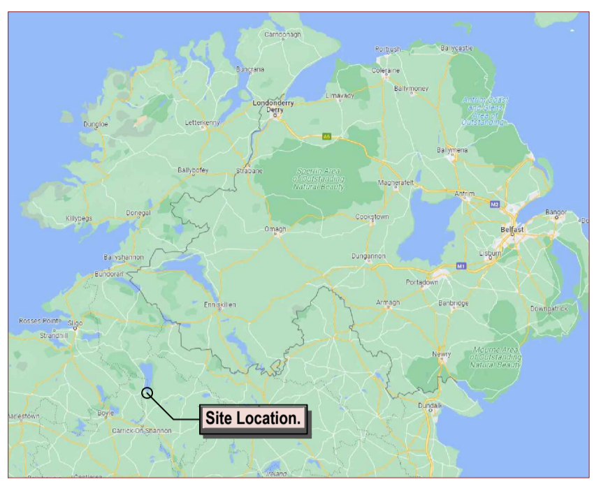
Location Map - NTS