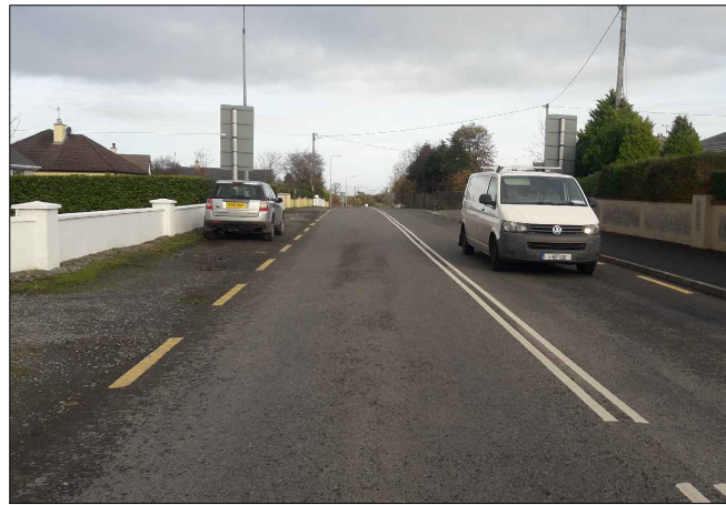
SITE PHOTO AT KINLOUGH SECTION A-A