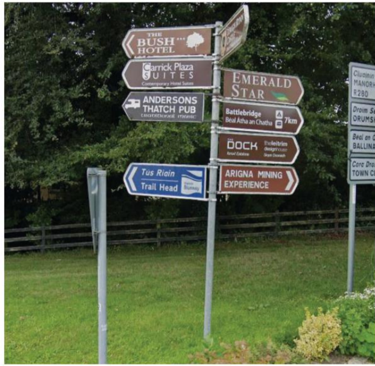
SIGNAGE 28 Signage to stay