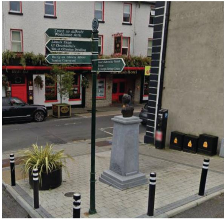
SIGNAGE 24 Signage to be relocated. See drawing 3022 for details, number 13.