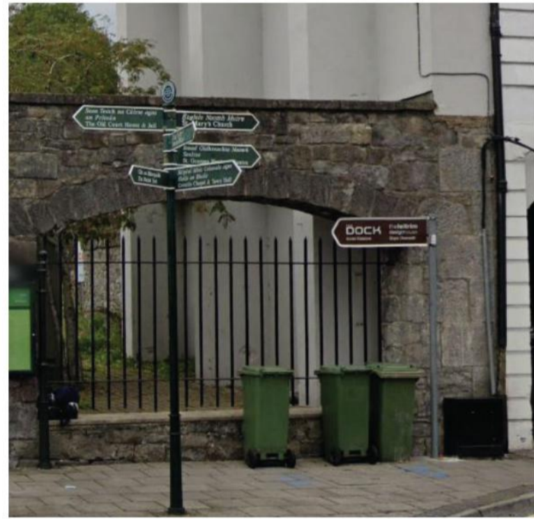
SIGNAGE 22 AND 23 Signages to be relocated. See drawing 3021 for details, number 10.