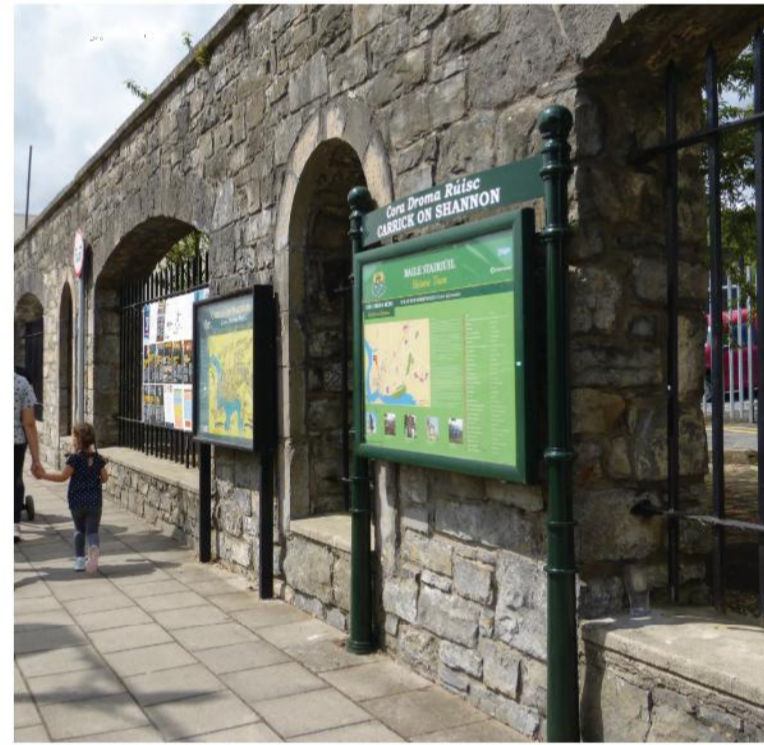
SIGNAGE 20 AND 21 Signage to be relocated.