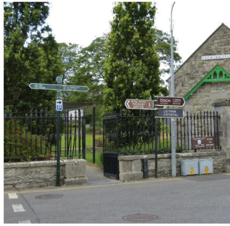
SIGNAGE 12 AND 13 Signages to be relocated. See drawing 3020 and 3200 for details, number 5.