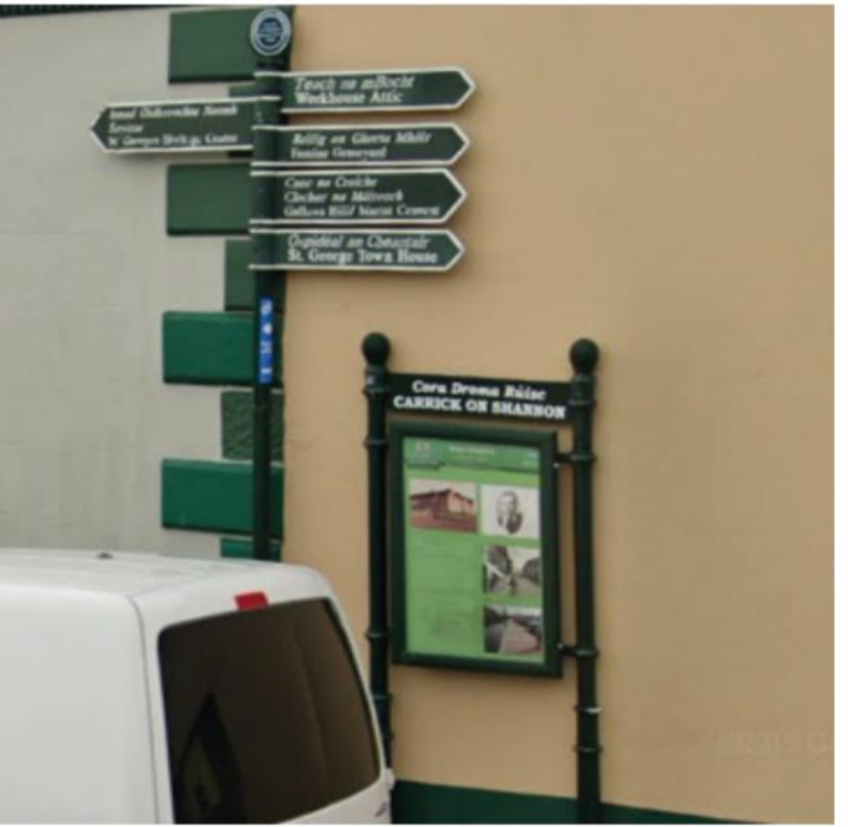
SIGNAGE 26 AND 27 Signages to be relocated. See drawing 3022 for details, number 16.