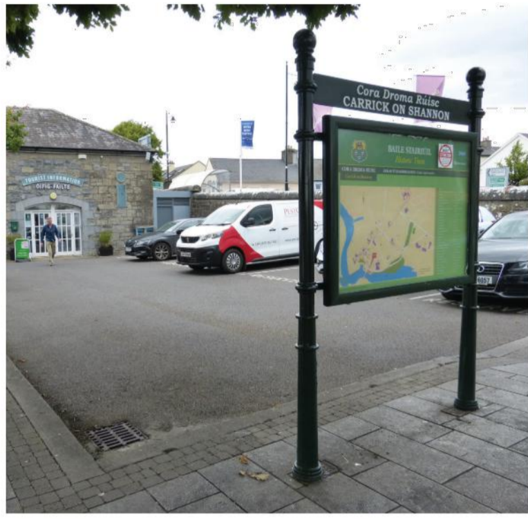
SIGNAGE 9 Signage to stay