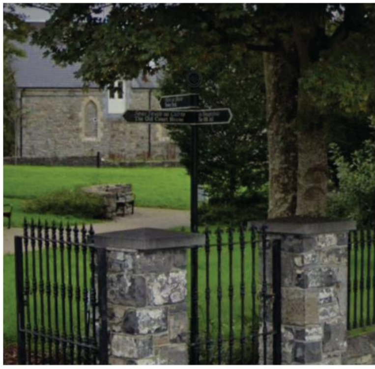
SIGNAGE 14 Signage to be relocated. See drawing 3020 and 3200 for details, number 6.