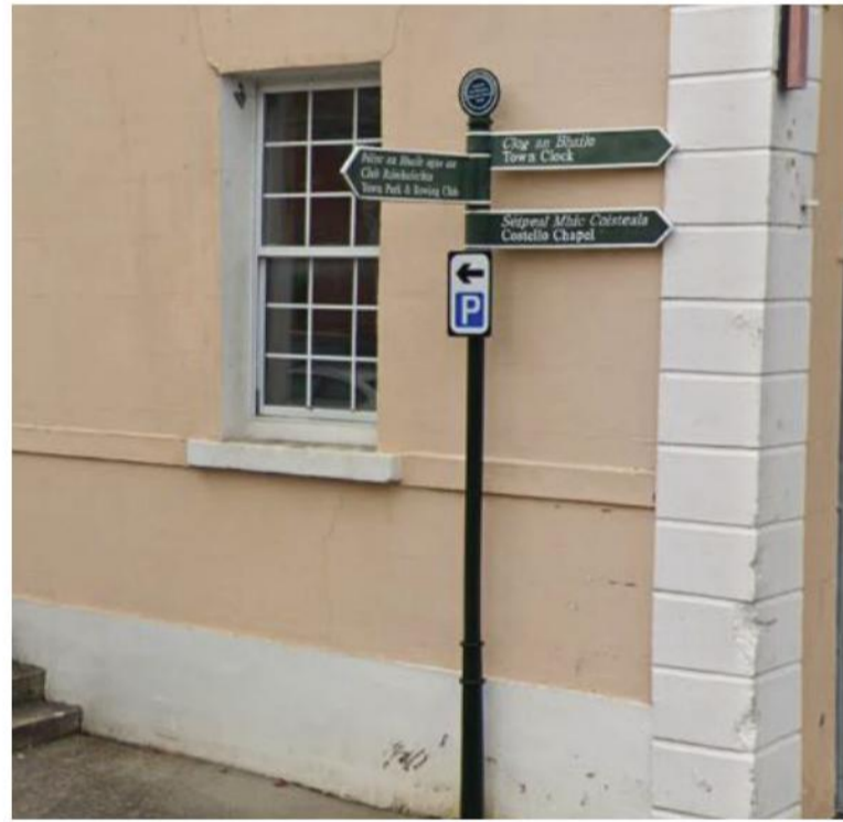
SIGNAGE 19 Signage to be relocated. See drawing 3021 for details, number 9.