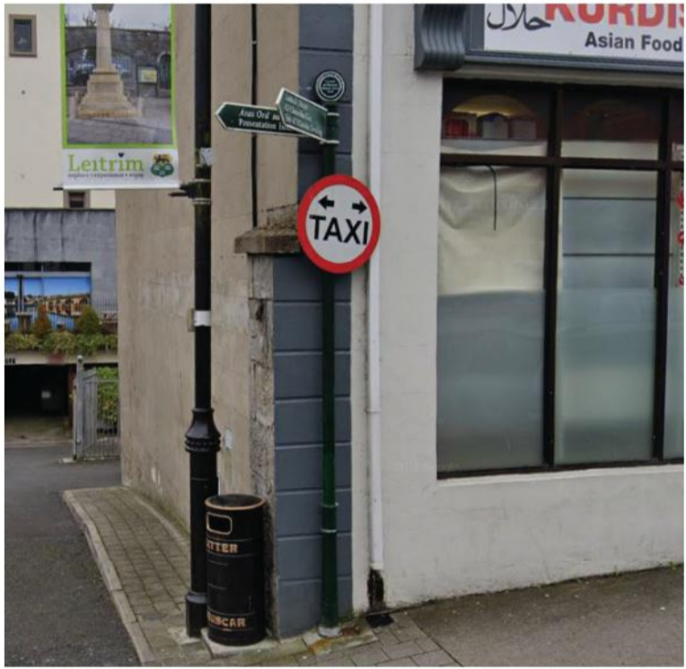
SIGNAGE 25 Signage to be relocated. See drawing 3022 for details, number 15.