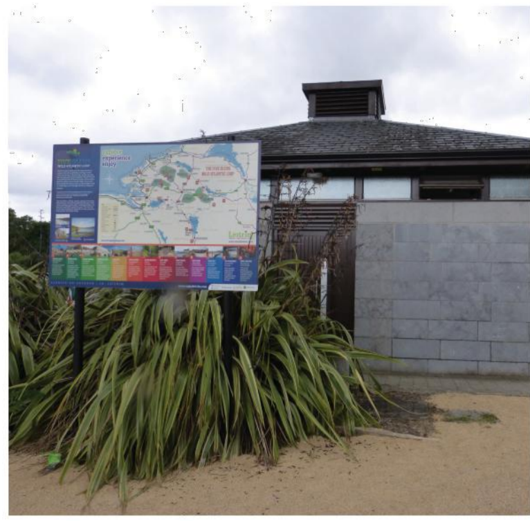
SIGNAGE 5 Signage to be replaced. See drawing 2201 for details.