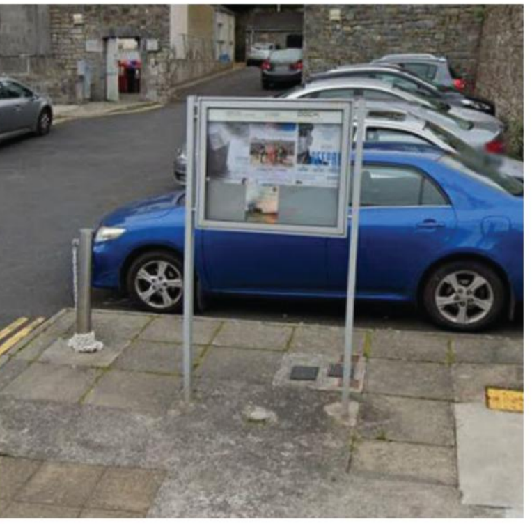
SIGNAGE 17 Signage to stay