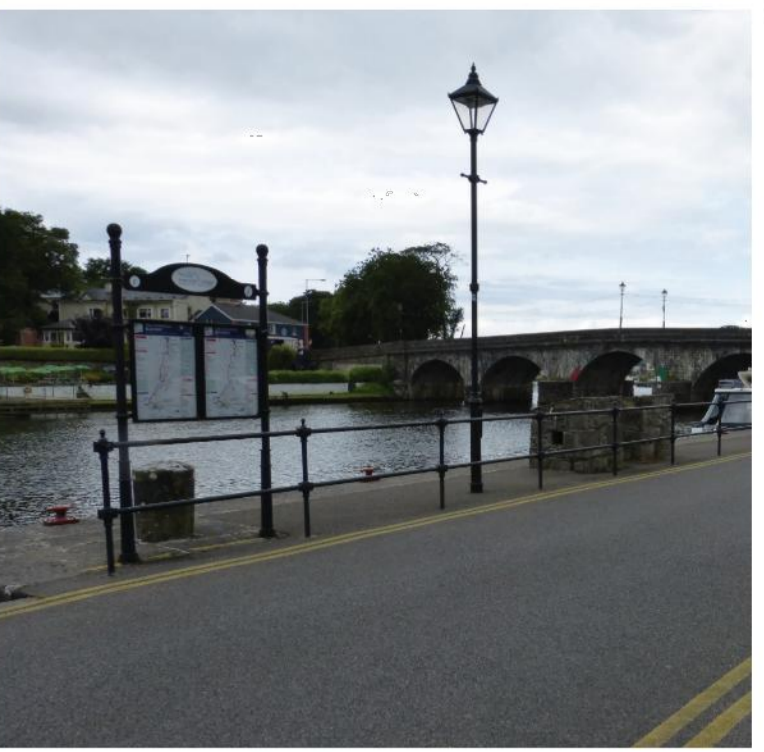
SIGNAGE 8 Signage to stay