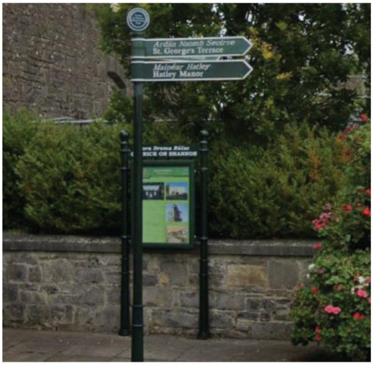
SIGNAGE 15 AND 16 Signages to be relocated. See drawing 3021 for details, number 8.