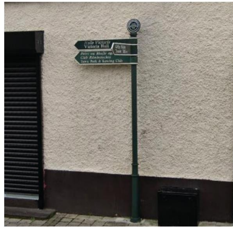
SIGNAGE 11 Signage to be relocated. See drawing 3020 for details, number 4.