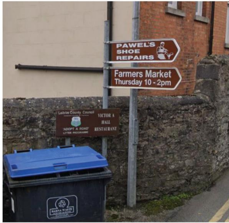
SIGNAGE 18 Signage to stay