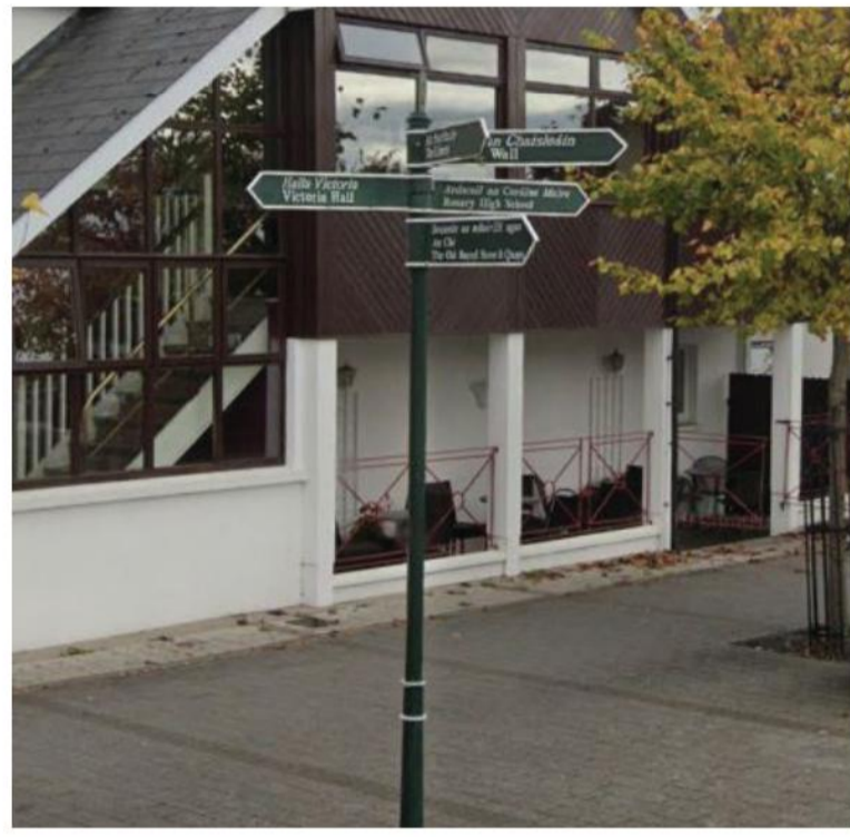
SIGNAGE 10 Signage to stay