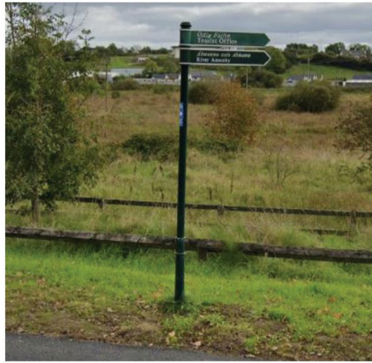
SIGNAGE 29 Signage to stay