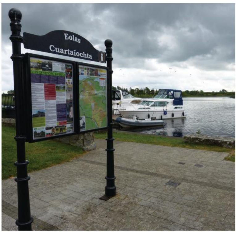
SIGNAGE 7 Signage to stay