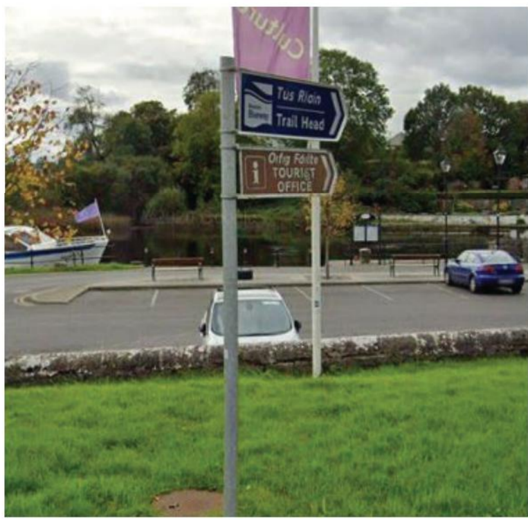
SIGNAGE 6 Signage to stay