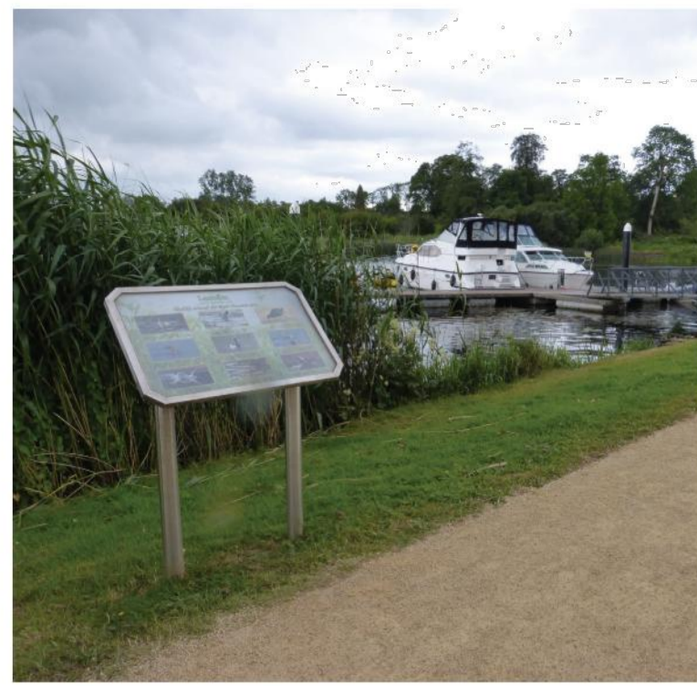
SIGNAGE 4 Signage to stay