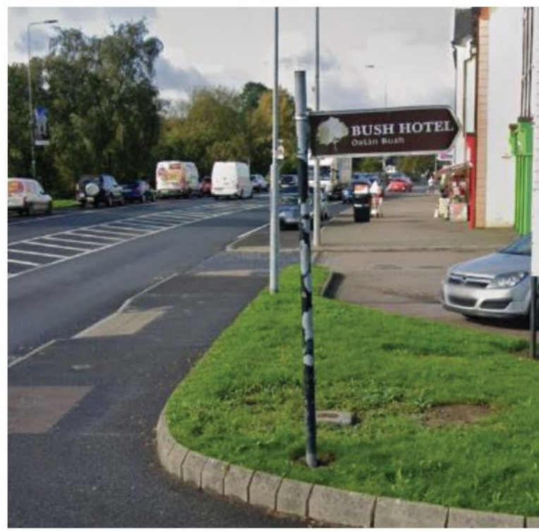
SIGNAGE 3 Signage to stay