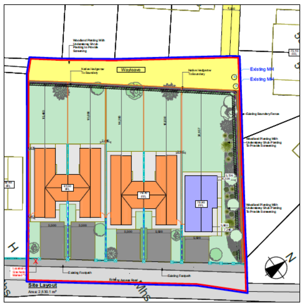
FIGURE 2: Plan of the proposed development area