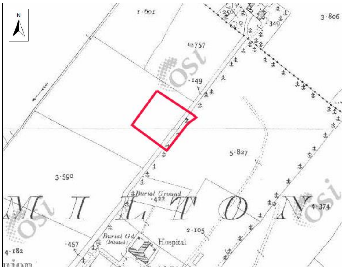
FIGURE 4: Extract from 25-inch OS map of 1907–9, showing the proposed development area

The cartographic sources depict the proposed development area as undeveloped greenfield. The first edition OS map of 1835–6, shows the site as agricultural land on the outskirts of Manorhamilton village. By the time of the 25-inch map of 1907–9, Hospital Road to the immediate southeast of the site has been established (Figure 4).