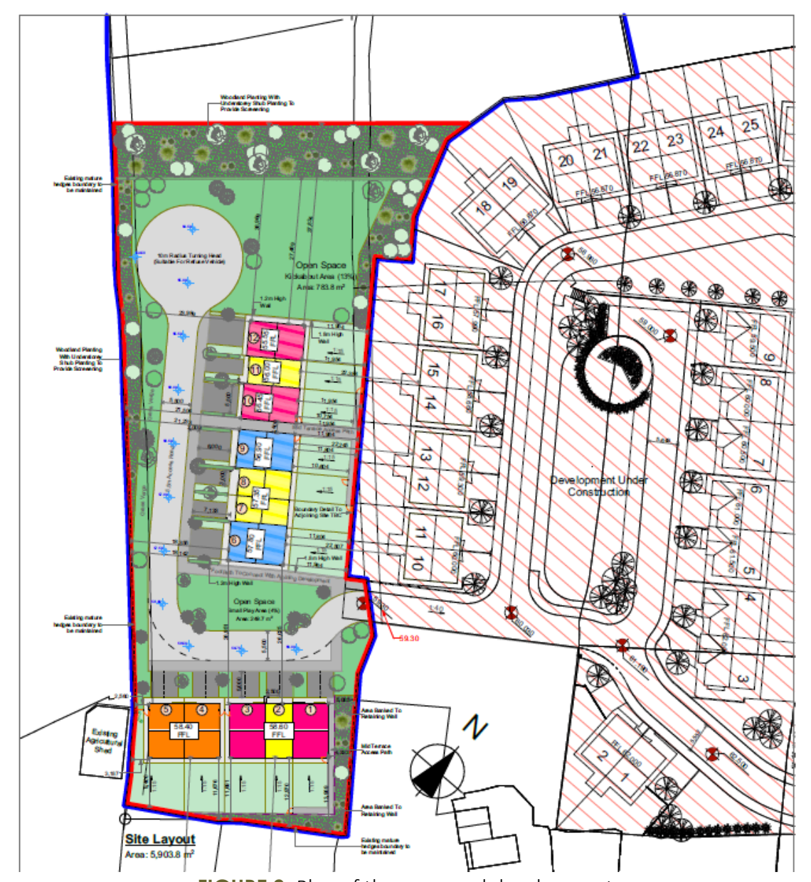
FIGURE 2: Plan of the proposed development