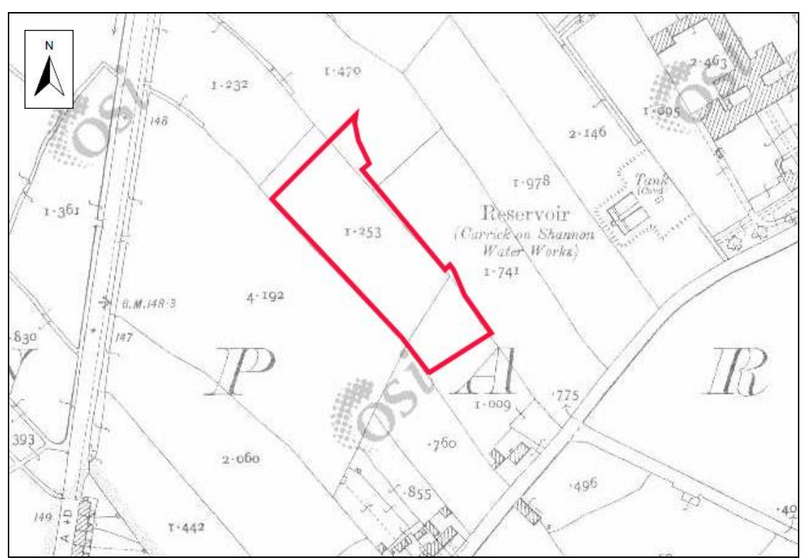
FIGURE 4: Extract from 25-inch OS map of 1907–9 showing proposed development area

unenclosed greenfield. The boundary in the south of the site is shown with the southeastern portion of the site forming part of a separate plot. By the time of the 25-inch OS map of 1907–9, the site has been enclosed by field boundaries (Figure 4). The northeast—southwest field boundary depicted in the earlier first edition mapping is present.