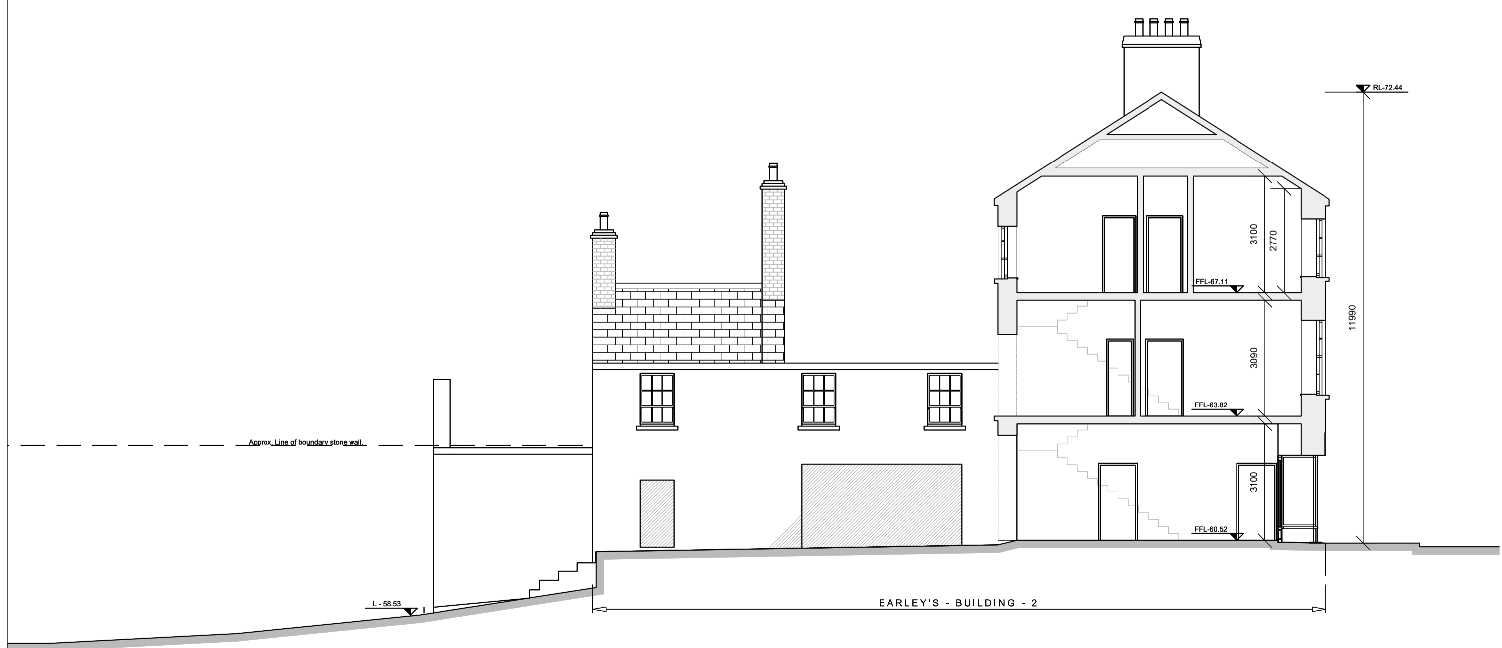
Existing Section D-D & Hidden Elevation Scale 1:100