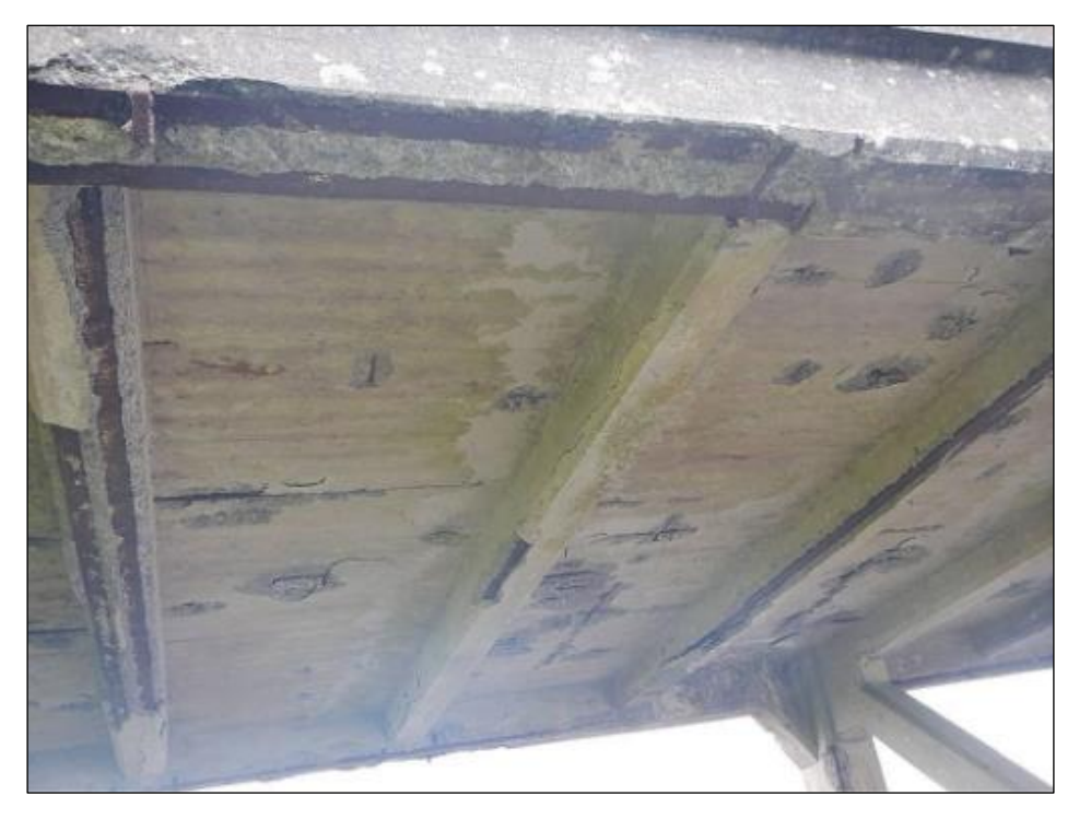
Figure 4 - Example of extensive spalling and reinforcement corrosion