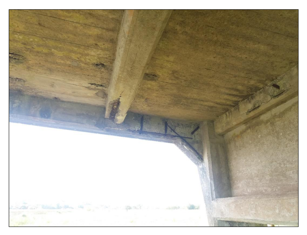
Figure 3 - Example of extensive spalling and reinforcement corrosion