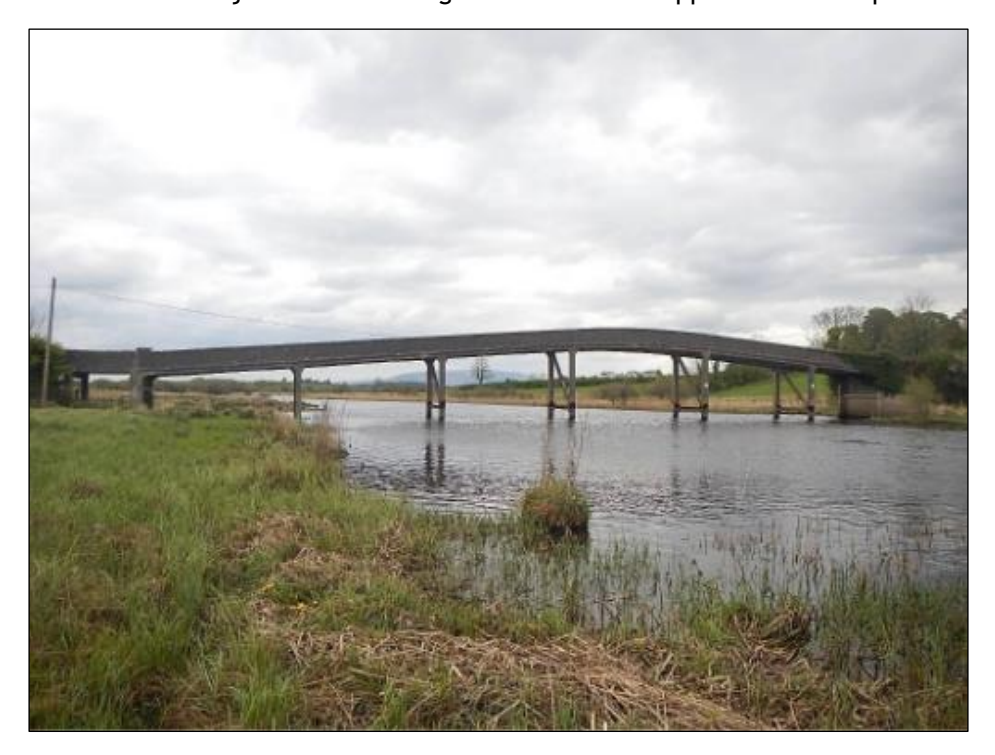
Figure 1 - Existing Hartley Bridge Elevation

The findings of the Stage 2 Assessment's visual inspection conclude it is evident that the bridge is nearing the end of its serviceable life with deterioration of fabric of the structure likely to accelerate in the short to medium term. It also recommends that provision should be made for replacing the structure in the short to medium term subject to the findings of an economic appraisal of the options.