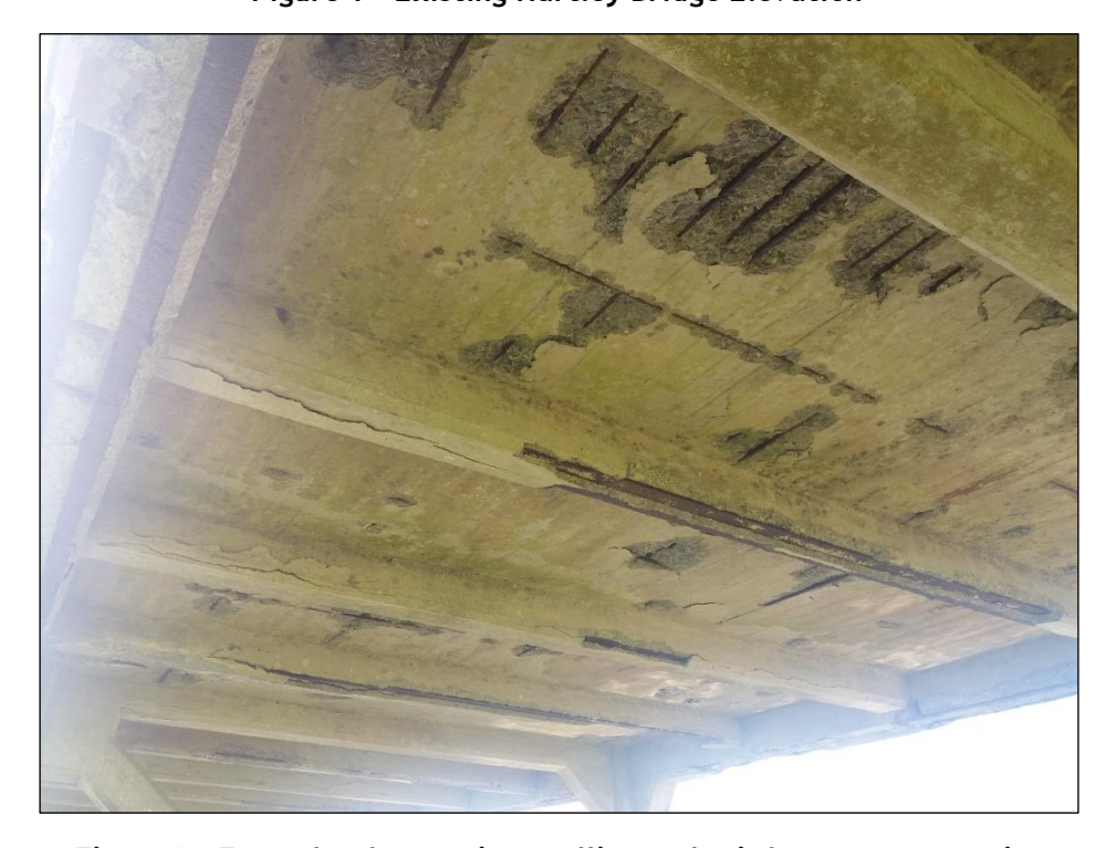
Figure 2 - Example of extensive spalling and reinforcement corrosion