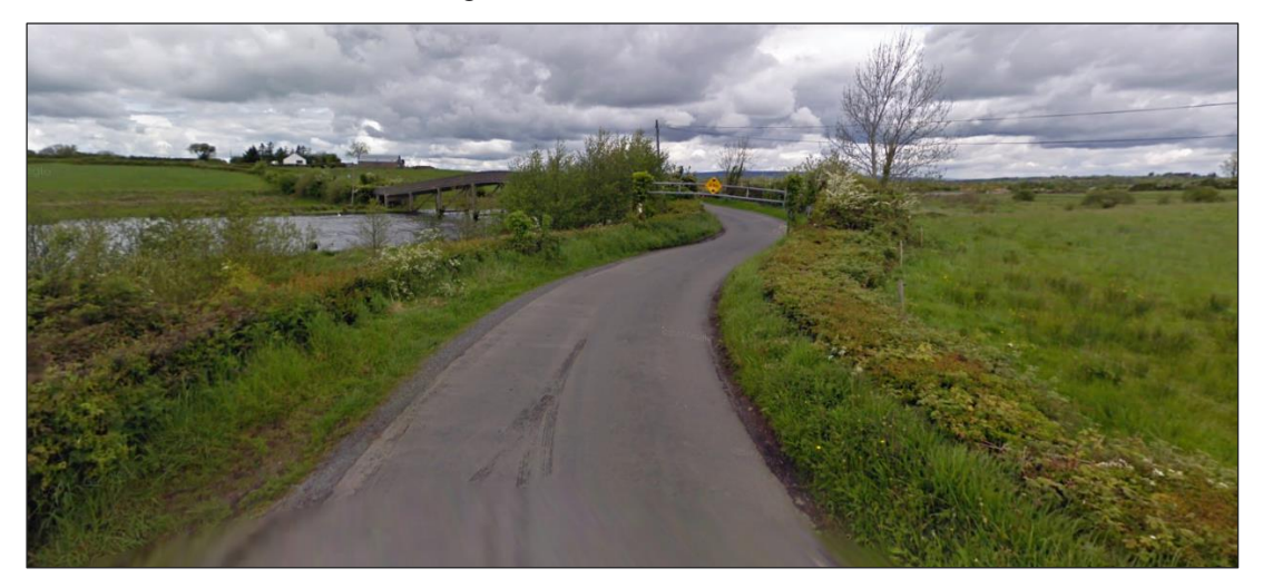
Figure 4-2: L3400 (Eastern Approach, i.e. Leitrim Side)