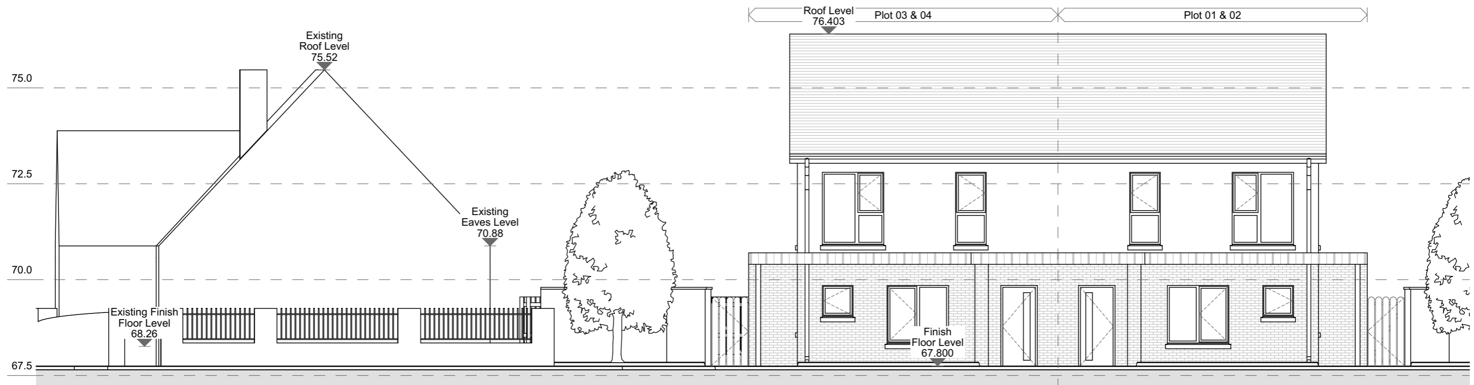
1 Street Elevation 01 1:100