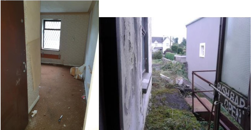
FIG. 52/53: bedroom/ rear escape