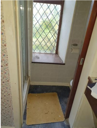
FIG. 39/40: corner room