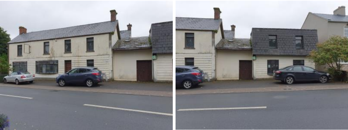
FIG. 4 & 5: Elevations: Front(southwest)