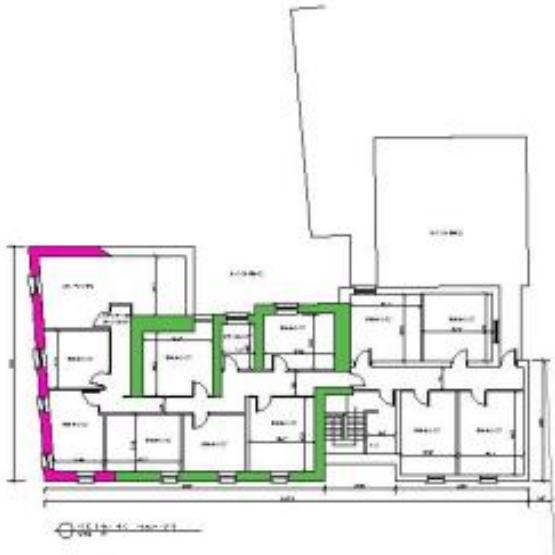
FIG. 14: Existing plans