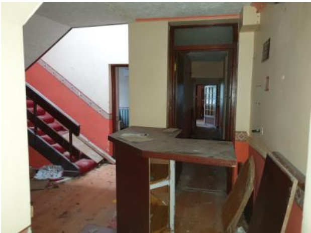
FIG. 27: Reception