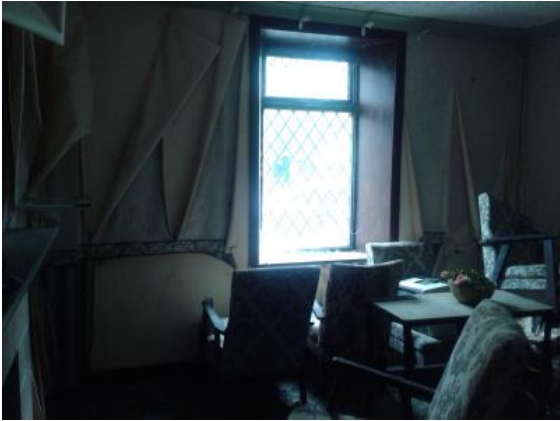
FIG. 17 & 18: Front Lounge