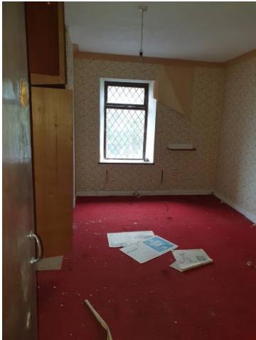
FIG. 48: bedroom