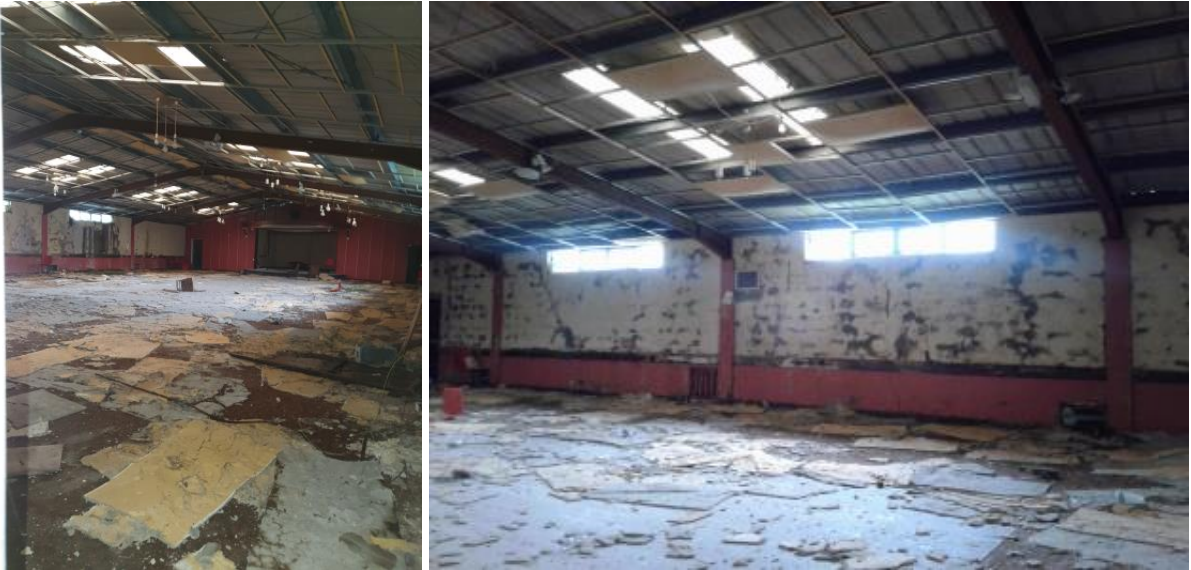
FIG. 32 & 33: view of ballroom