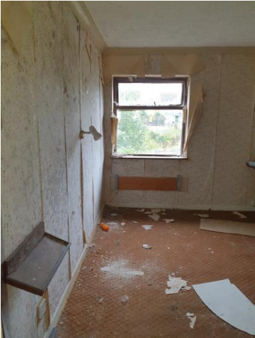
FIG. 49: bedroom