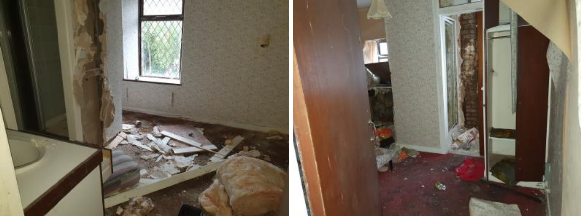
FIG. 42 & 43: bedrooms