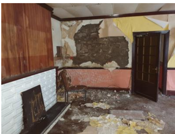
FIG. 21 & 22: Main Bar