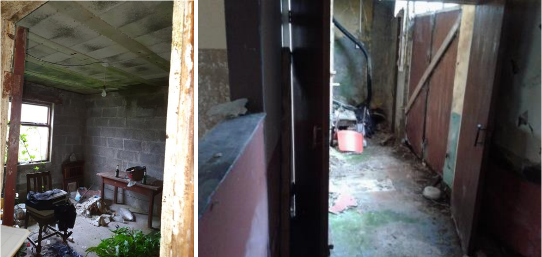
FIG. 30 & 31: view of rear sheds/stores