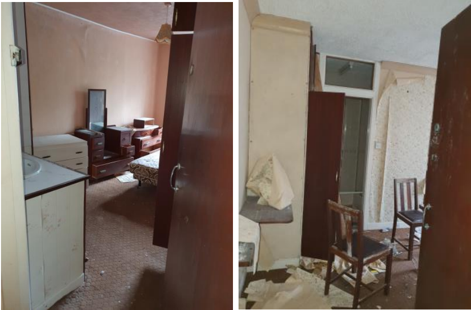
FIG. 50/51: bedroom