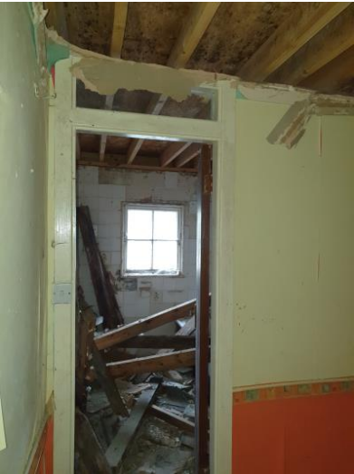
FIG. 44 & 45: bedrooms