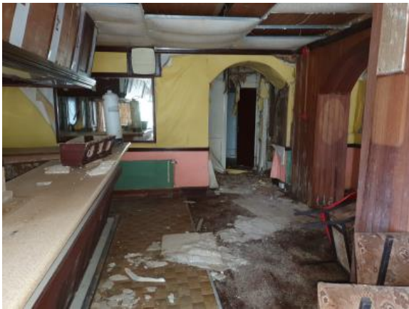
FIG. 19 & 20: Main Bar