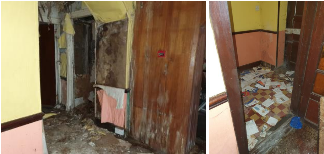
FIG. 23 & 24: Main Bar