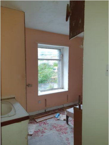
FIG. 47: bedroom