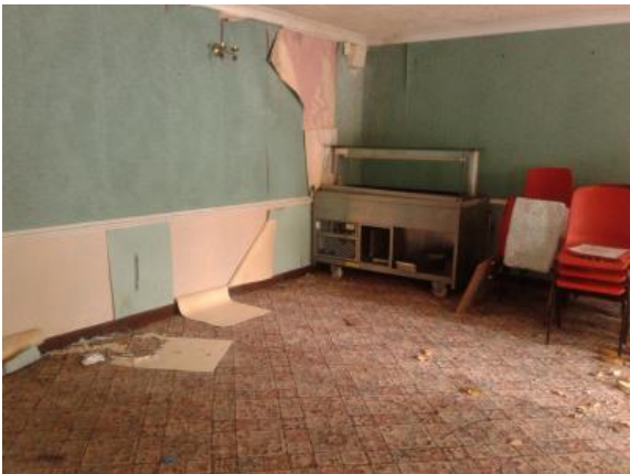
FIG. 15 & 16: hotel reception