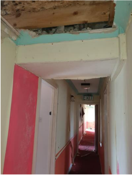
FIG. 46: bedroom corridor