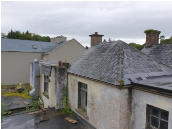
FIG. 10 & 11: side view and rear view