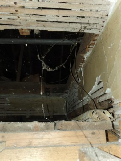
FIG. 36 & 37: bathroom basement level