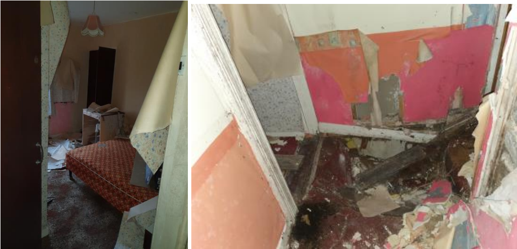
FIG. 40/41: corner bedroom/corridor