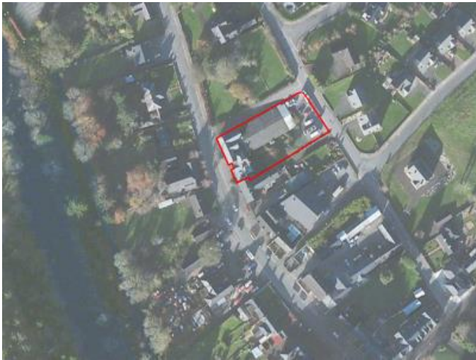
FIG. 1: Google Maps