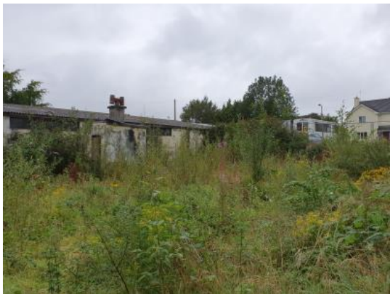
FIG. 6 & 7: Rear views form North