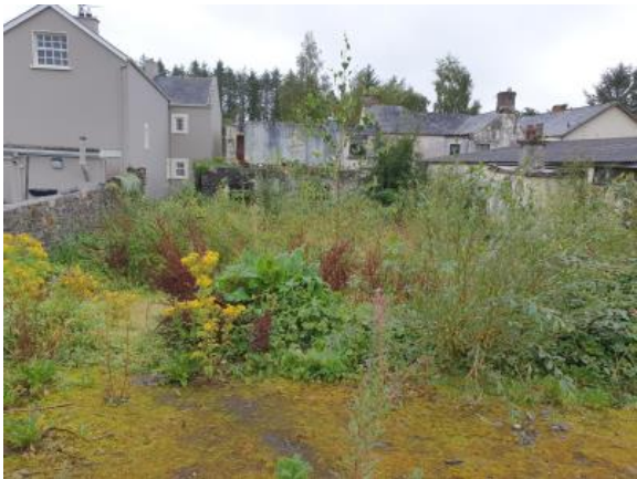
FIG. 8 & 9: Side view and rear view