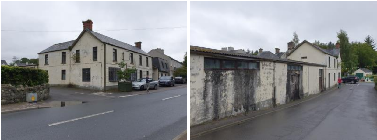
FIG. 2 & 3: Elevations: Front(southwest) & Side ( north west)