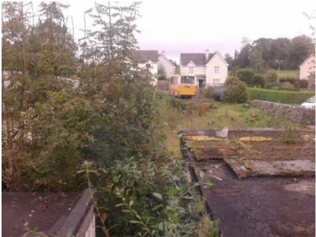
FIG. 12 & 13: rear views