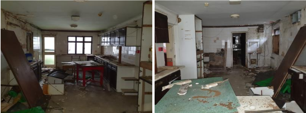
FIG. 28 & 29: rear kitchen