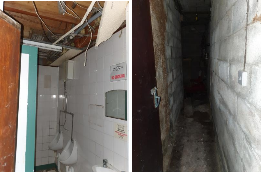
FIG. 25 & 26: Wc & Access corridor