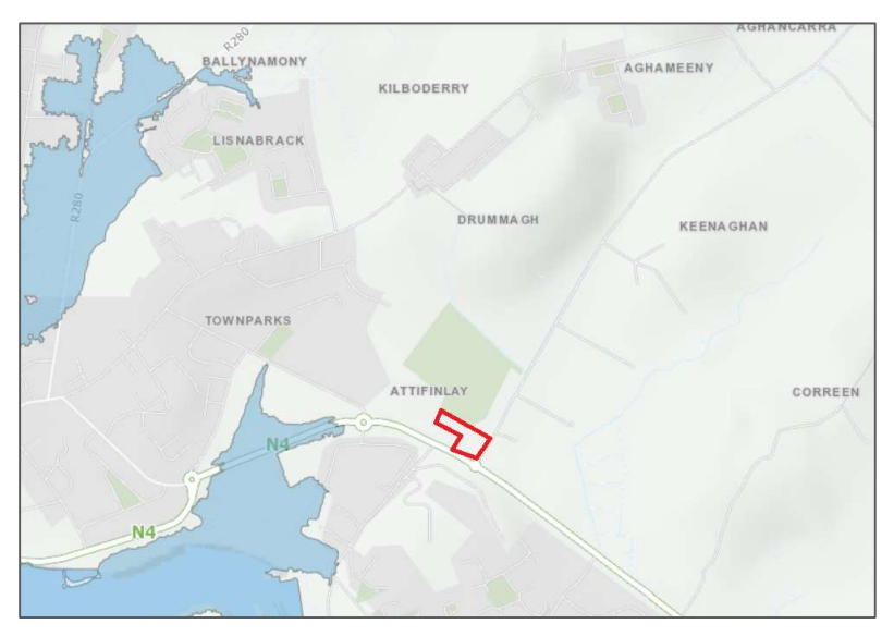
Figure 3.1 – Extract CFRAMS Fluvial Flood Extent Map

The OPW have published the Preliminary Flood Risk Assessment (PFRA) maps, in the form of maps covering the country. The PFRA is only a preliminary assessment, based on available or readily derivable information. It also states that areas where an on-site inspection is required to investigate the issues more closely, then those inspections will be carried out as part of the CFRAM Studies