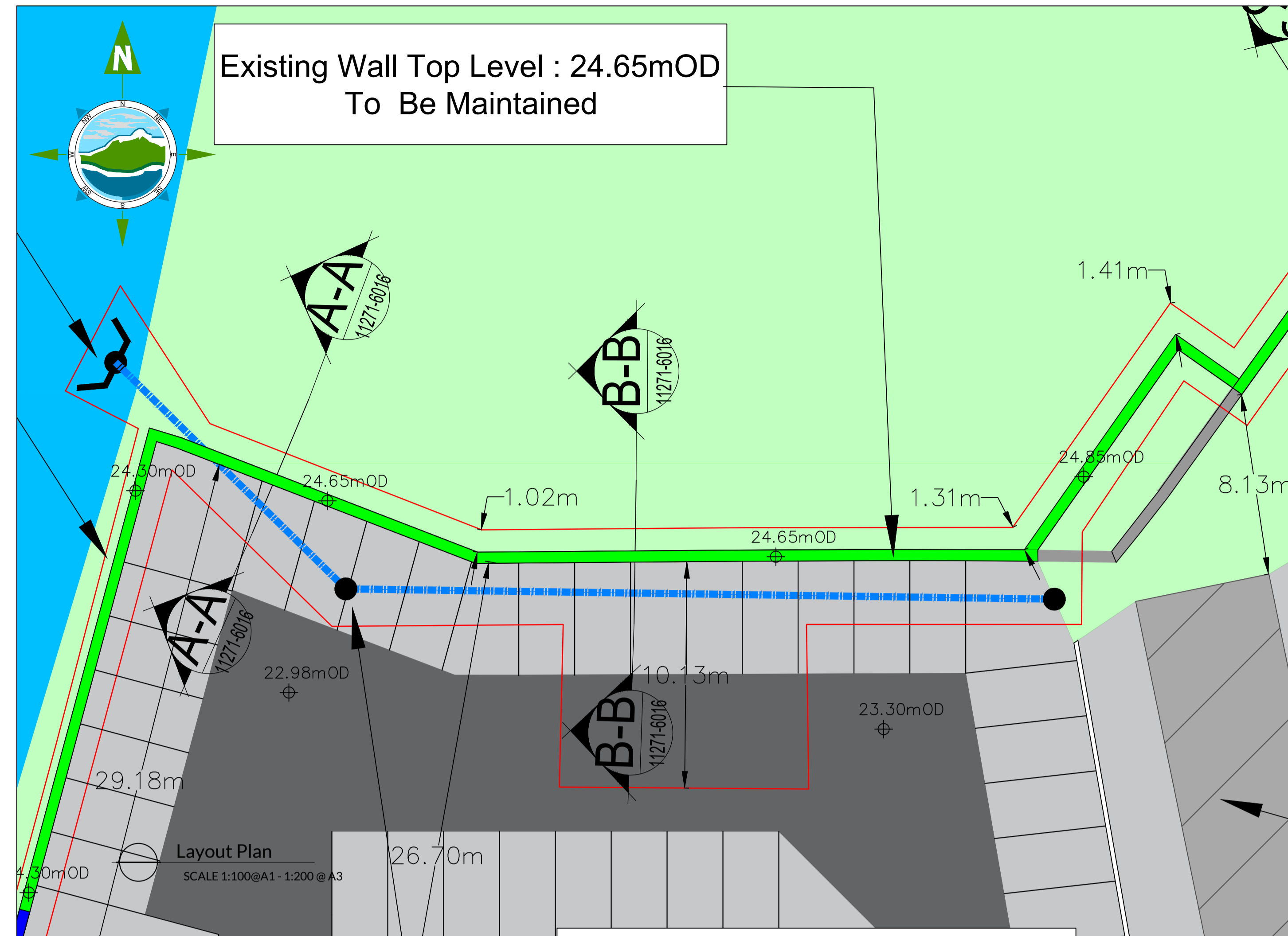
Proposed Surface Water Headwall Outfall With Flap Valve Detail