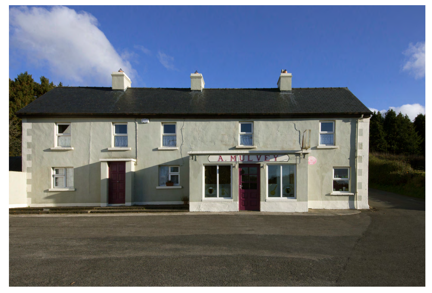
Name: A Mulvey Address: Ballinaglera, Co Leitrim

Type of Business: Pub and Grocery Status: In Business map ref: 6