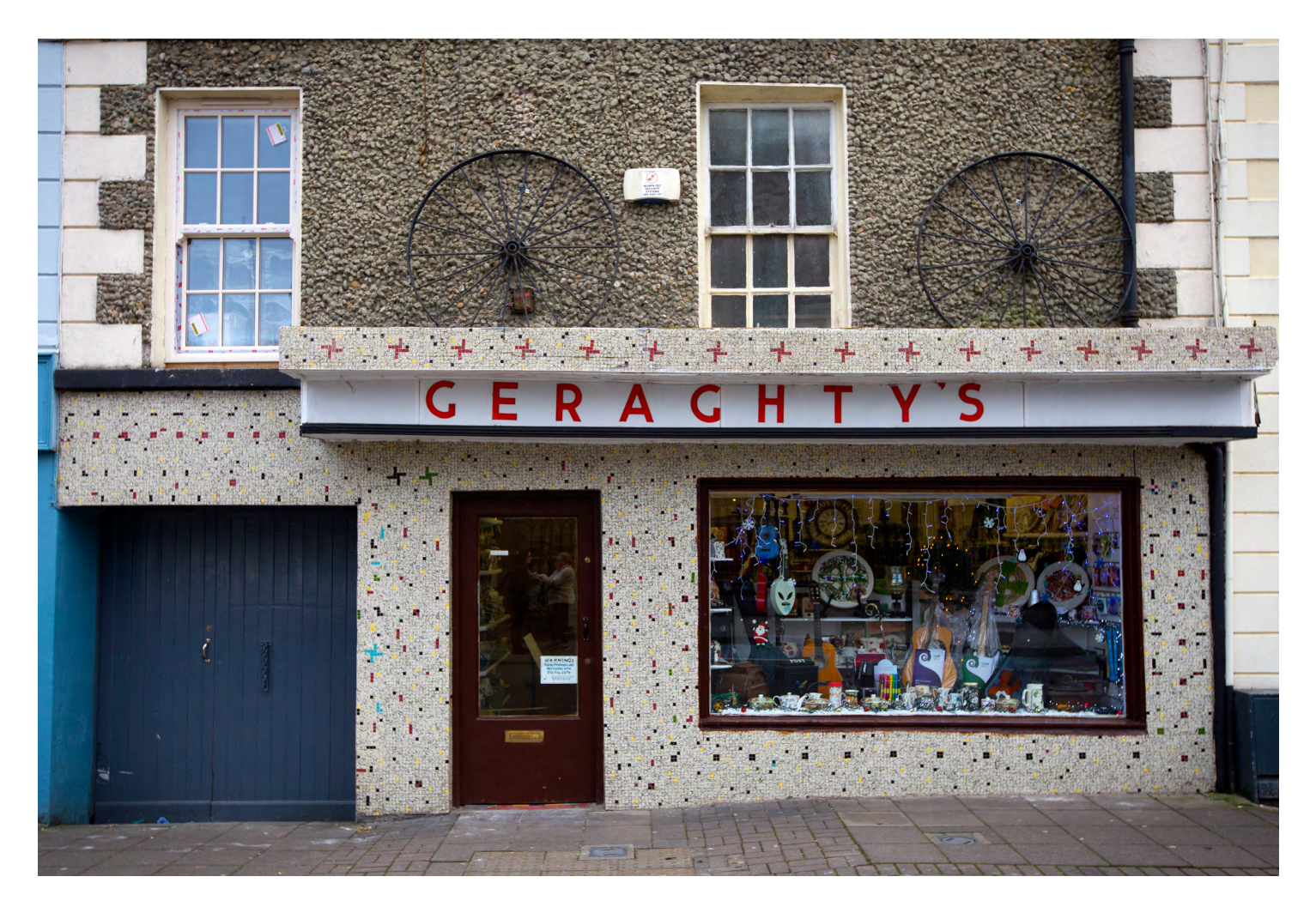
Name: Geraghty's Address: Main Street, Carrick-on-Shannon

Type of Business: Shop Mosaic tiles c. 1950's Status: In Business map ref: 3