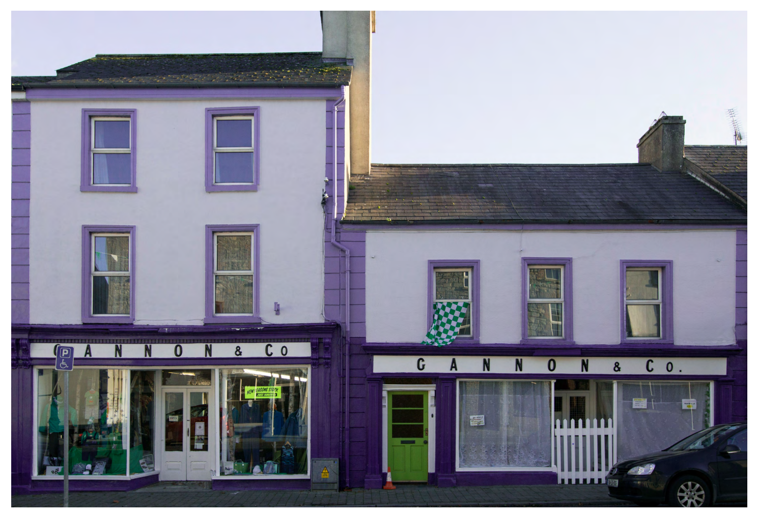
Name: Gannon & Co Address: Mohill, Co Leitrim

Type of Business: Drapery + Footwear Shop Status: In Business map ref: 22