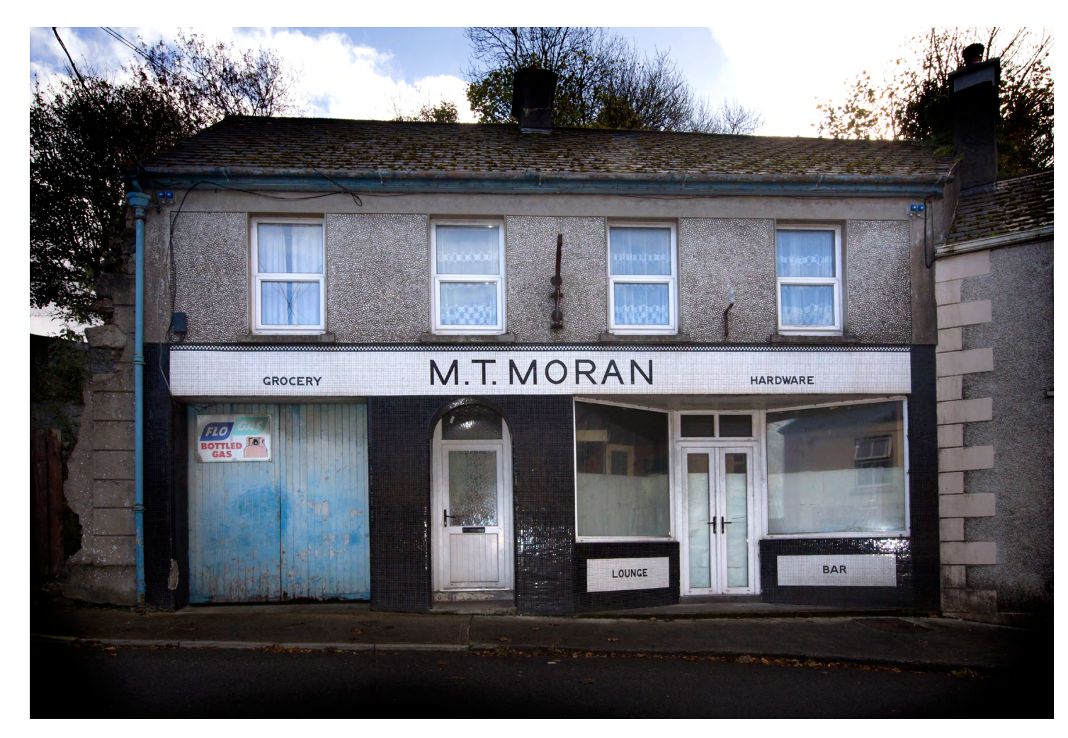
Name: M.T. Moran Address: Drumshanbo, Co Leitrim

Type of Business: Pub + Grocery Status: No longer in business map ref: 16