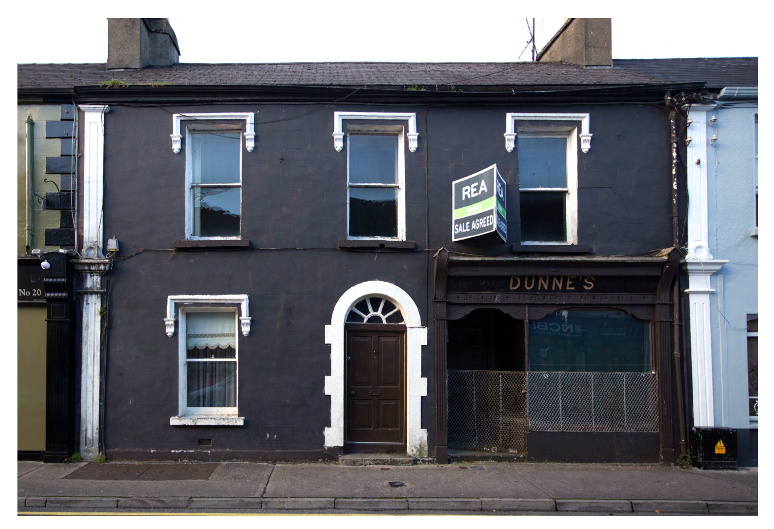
Name: Dunne's Address: Main Street, Carrick-on-Shannon

Type of Business: Jeweler Status: For sale at time of publication map ref: 4