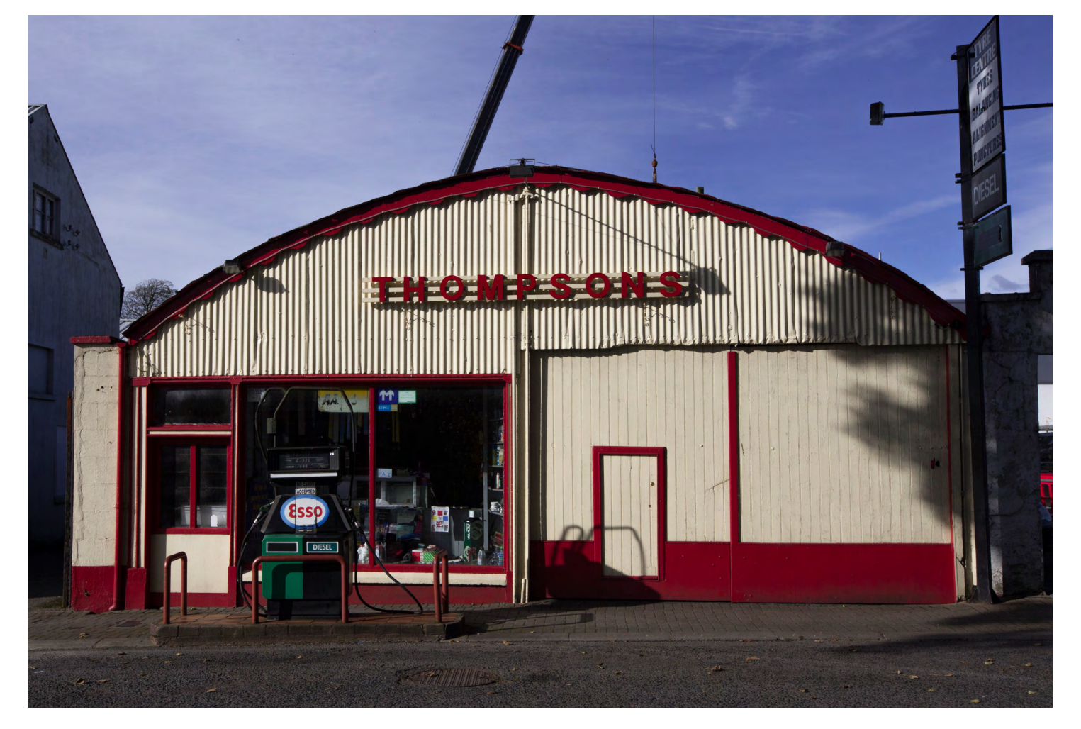
Name: Thompsons Address: Manorhamilton, Co Leitrim

Type of Business: Garage Status: In business map ref: 21