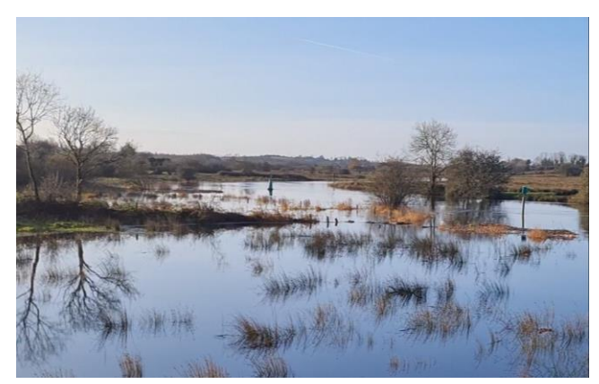
River Shannon, west of Leitrim Village during a site walkover in December 2021.