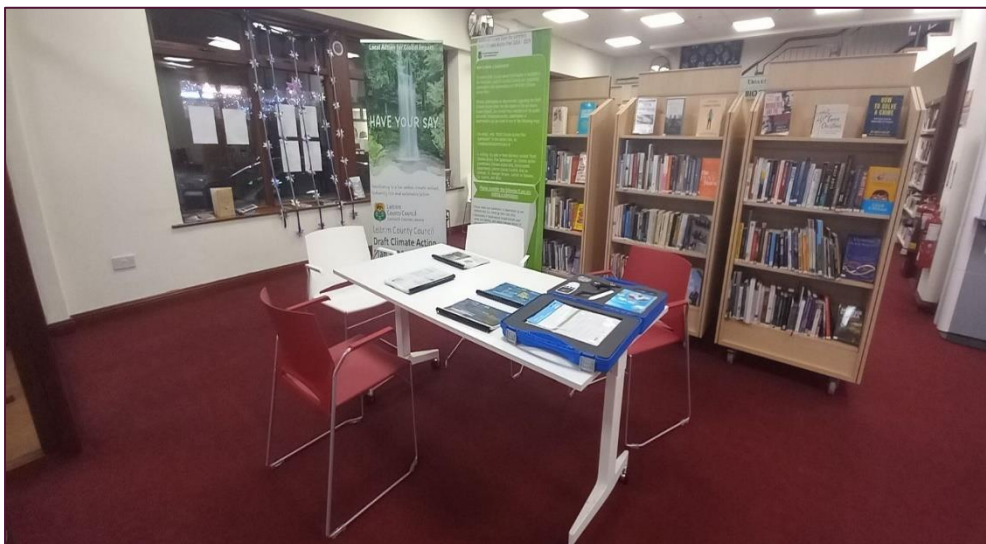
Figure 1 Pop up panels Manorhamilton Library, 12 December 2023

In total there were 4 number of attendees across all of the drop-in clinic evenings. Engagement varied from topics such as the format for making submissions, topics of interest to the attendee and suggestions for partnership with community groups.