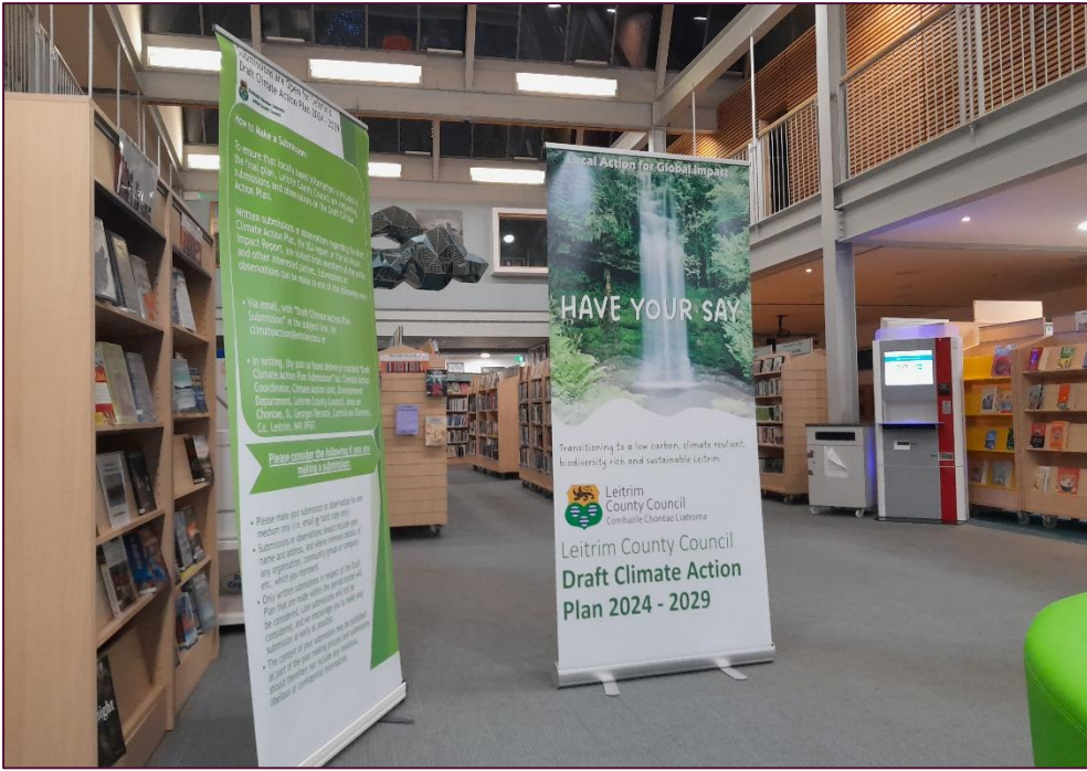
Figure 2 Pop-up panels Ballinamore Library, 14 December 2023