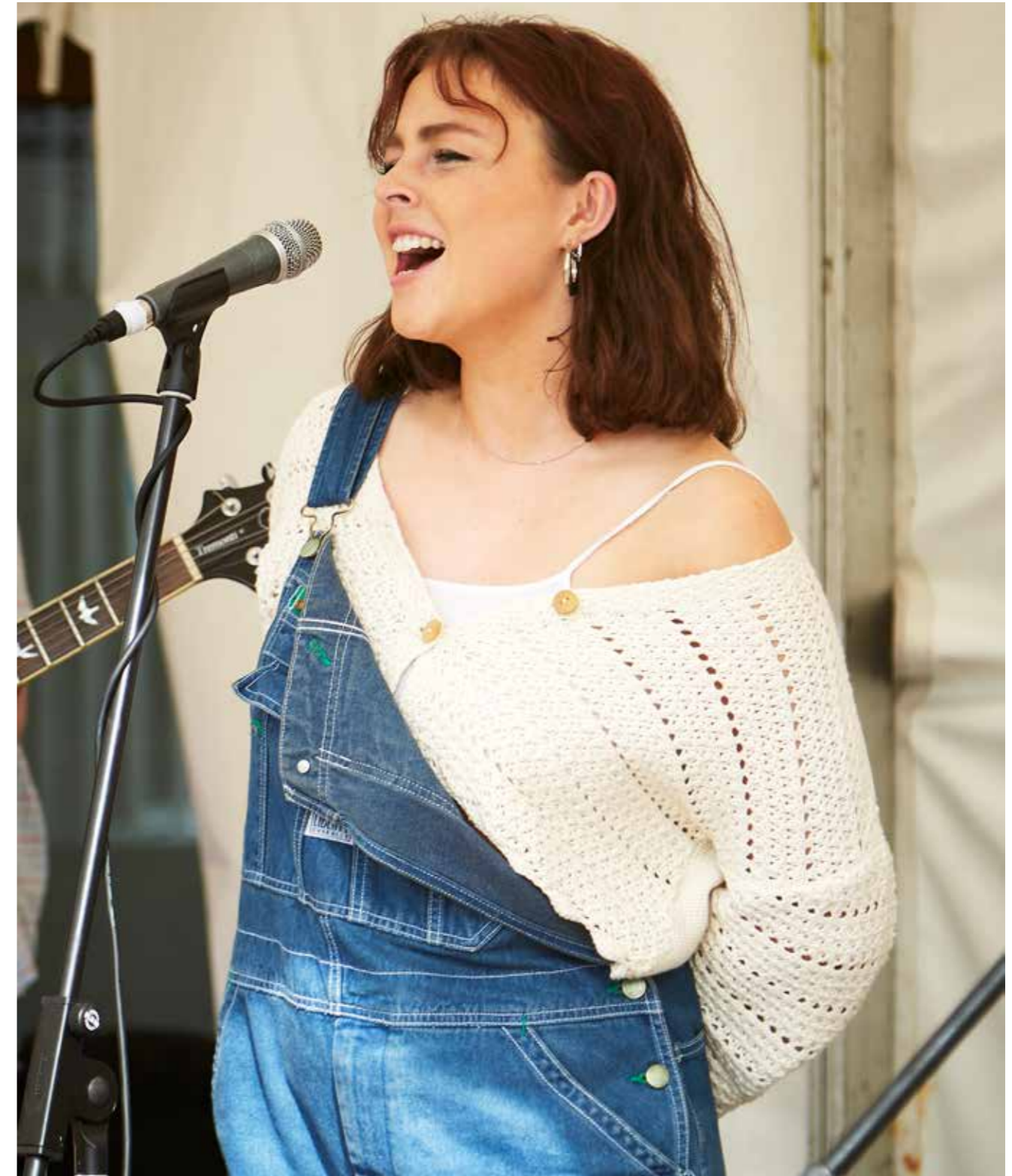
The Glens Street Session 2021

The opportunity embraced within the Leitrim Culture and Creativity Strategy 2023–2027 is to support people’s participation, inclusion and expression within communities, and further strengthen local creative economies.